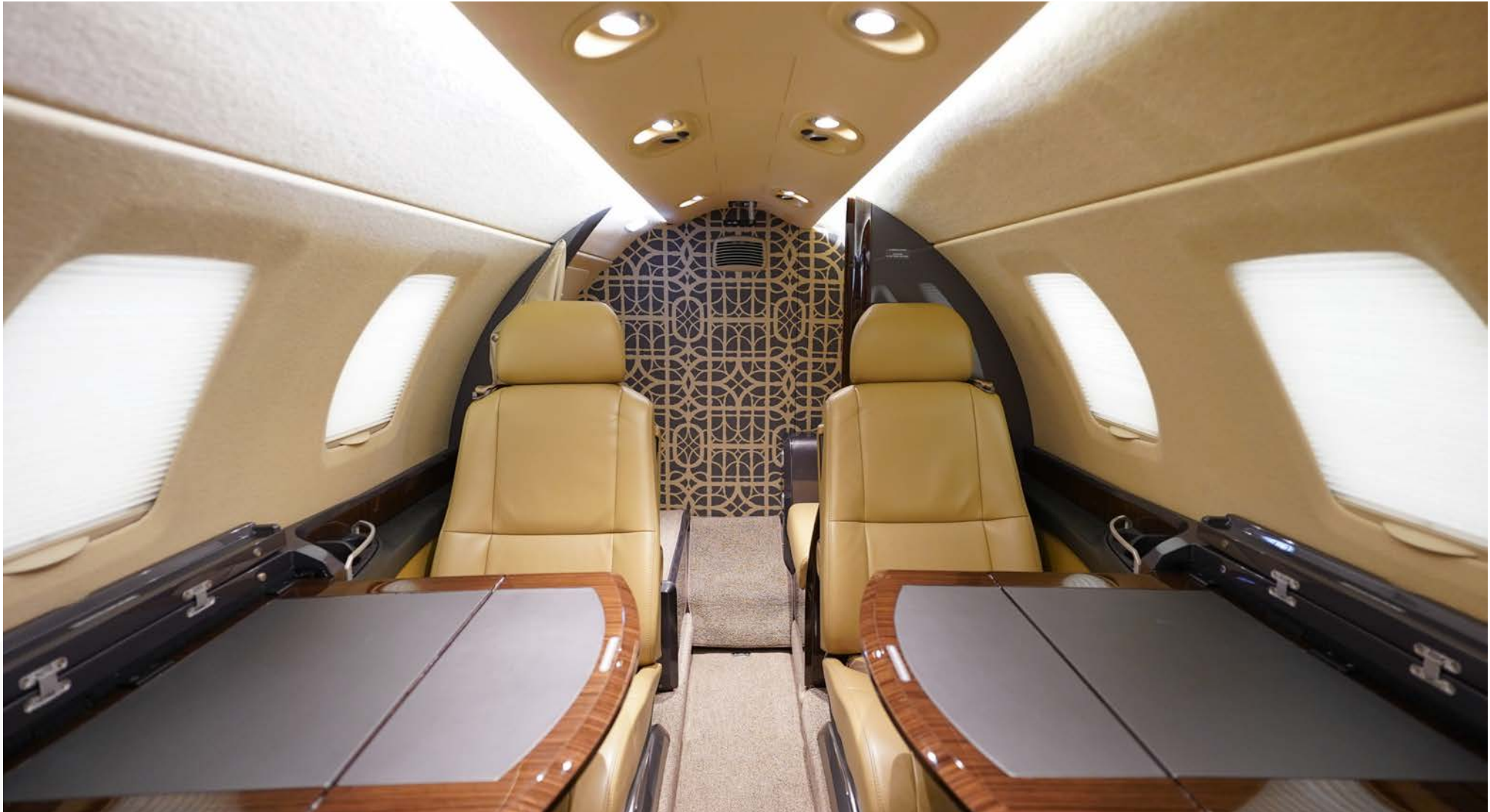
Aircraft Specifications Subject To Verification Upon Inspection. Aircraft Subject to Prior Sale or Withdrawal from Market.