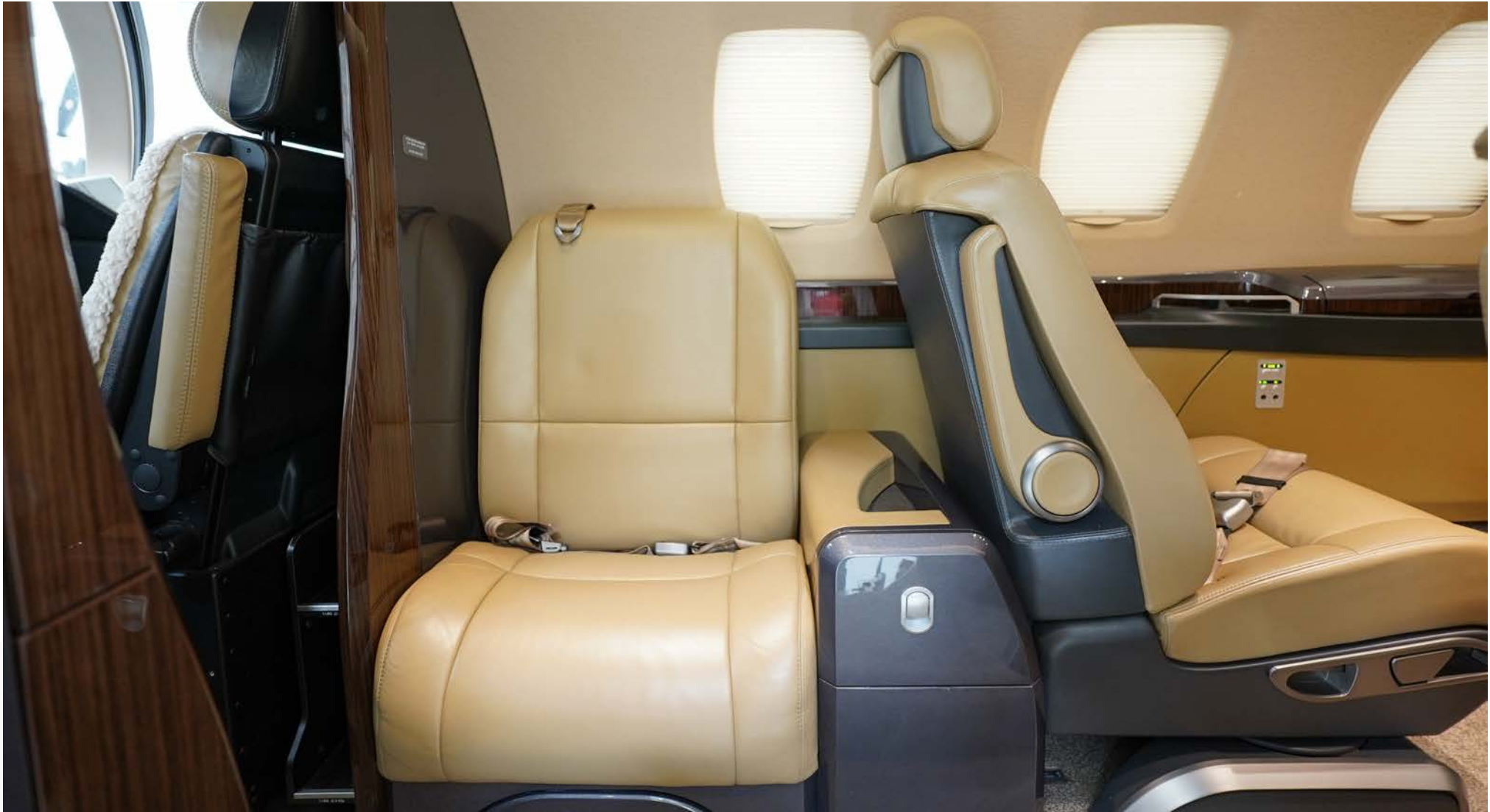
Aircraft Specifications Subject To Verification Upon Inspection. Aircraft Subject to Prior Sale or Withdrawal from Market.