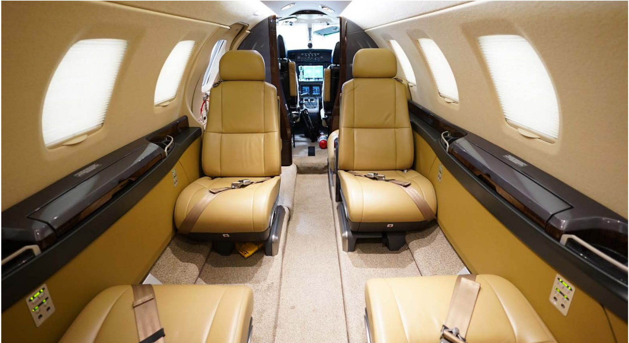
Aircraft Specifications Subject To Verification Upon Inspection. Aircraft Subject to Prior Sale or Withdrawal from Market.