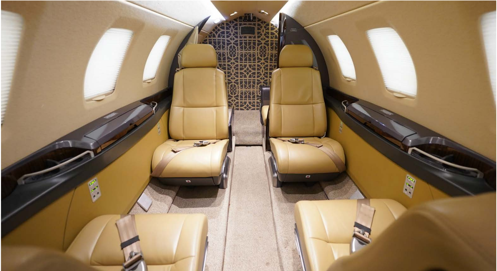
Aircraft Specifications Subject To Verification Upon Inspection. Aircraft Subject to Prior Sale or Withdrawal from Market.