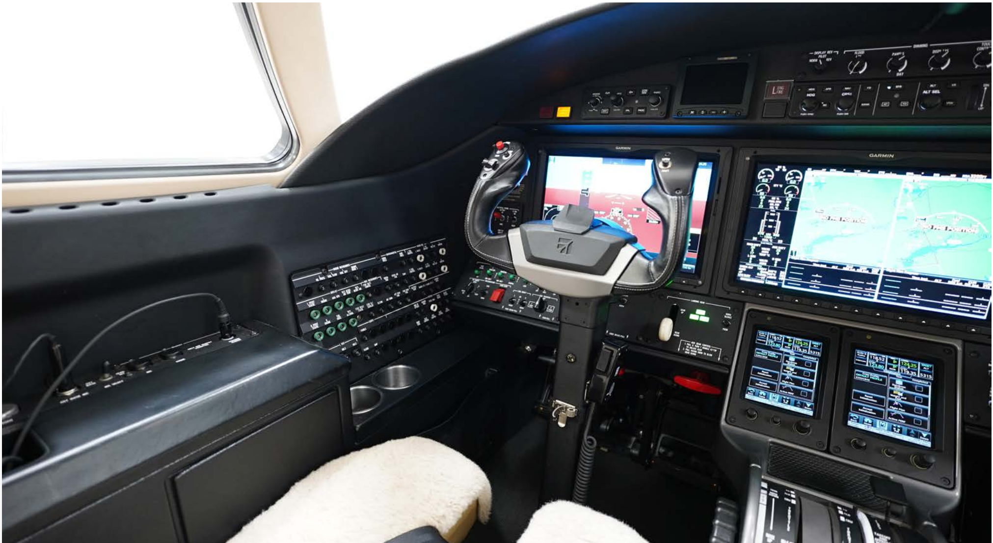
Aircraft Specifications Subject To Verification Upon Inspection. Aircraft Subject to Prior Sale or Withdrawal from Market.