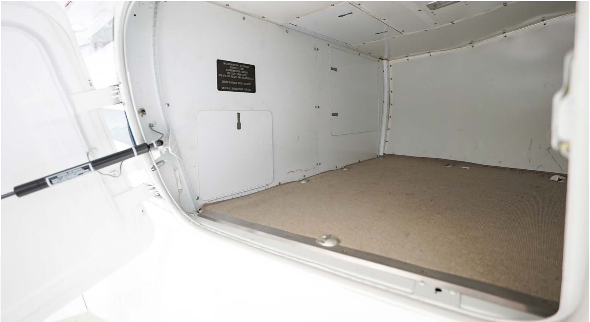
Aircraft Specifications Subject To Verification Upon Inspection. Aircraft Subject to Prior Sale or Withdrawal from Market.