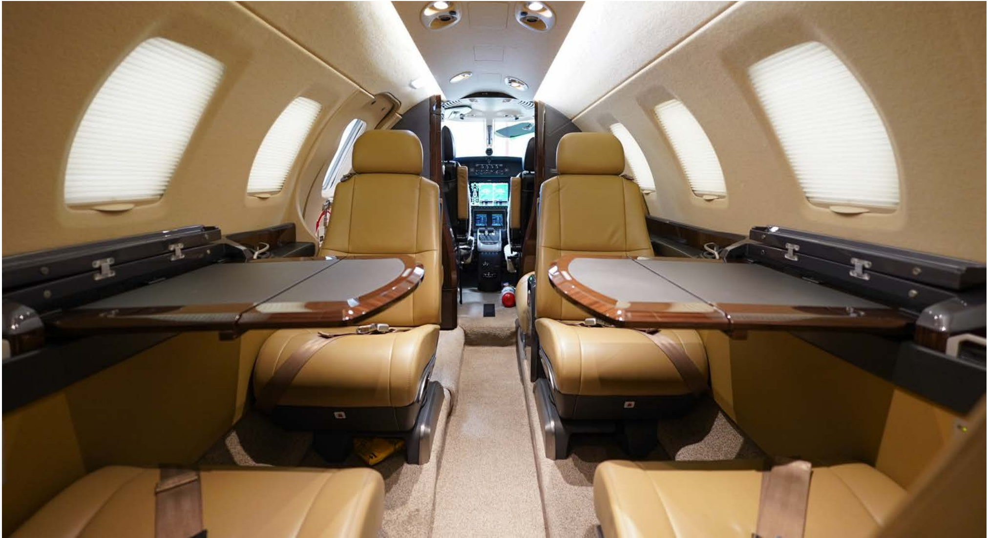
Aircraft Specifications Subject To Verification Upon Inspection. Aircraft Subject to Prior Sale or Withdrawal from Market.