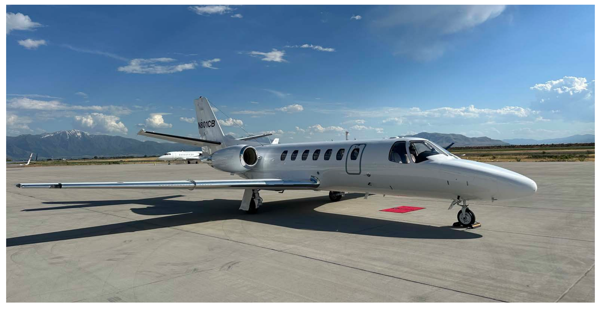
Specifications and descriptions are provided as introductory information only and do not constitute representations or warranties. Verification of specifications remains the sole responsibility of the purchaser. Photographs and images may have been altered to remove logos, registration marks, or other identifying information to protect the privacy of the current owner. Please note that images may not reflect the aircraft's most current condition as of this listing. The aircraft is subject to prior sale, lease, or removal from the market without notice.