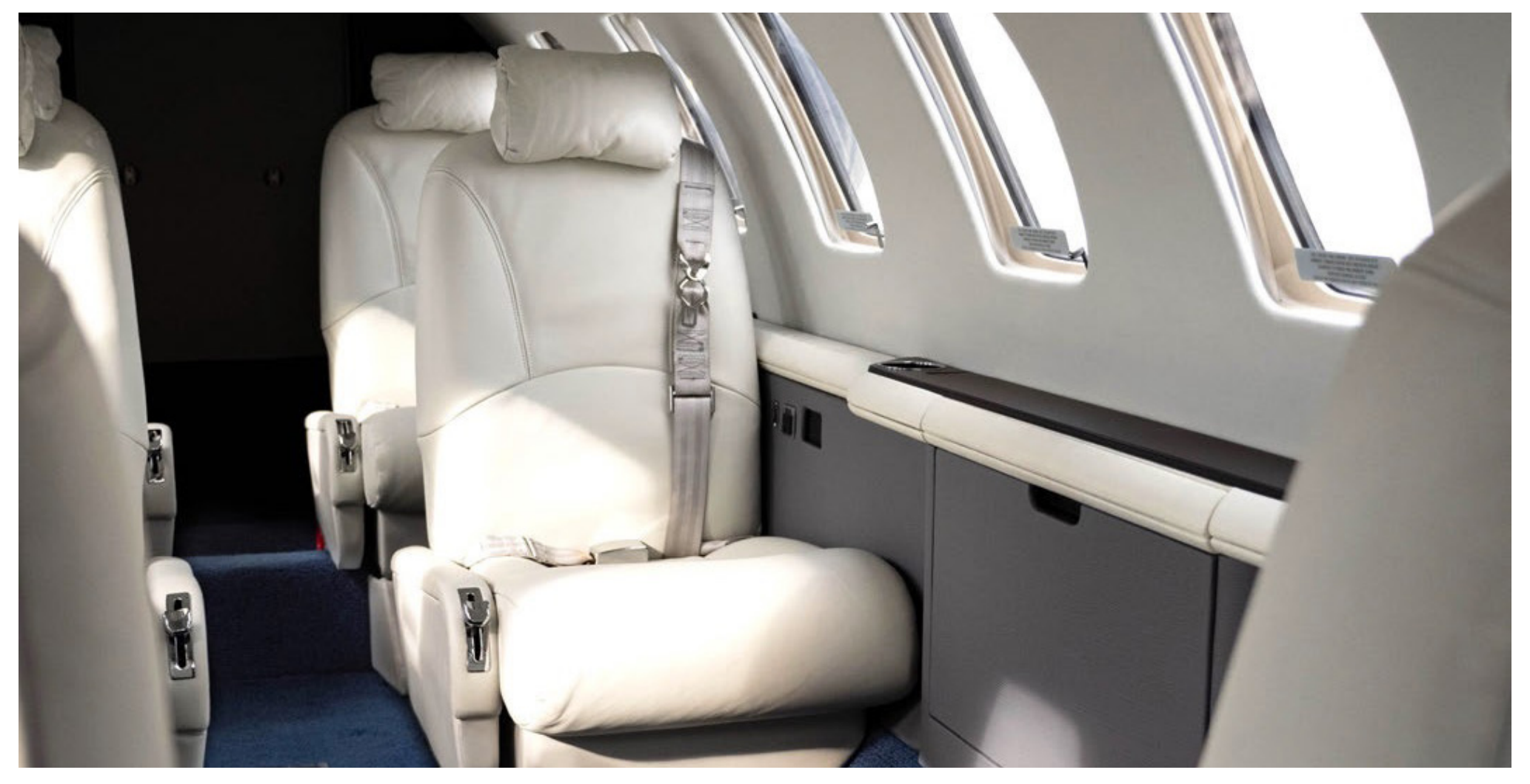
Specifications and descriptions are provided as introductory information only and do not constitute representations or warranties. Verification of specifications remains the sole responsibility of the purchaser. Photographs and images may have been altered to remove logos, registration marks, or other identifying information to protect the privacy of the current owner. Please note that images may not reflect the aircraft's most current condition as of this listing. The aircraft is subject to prior sale, lease, or removal from the market without notice.