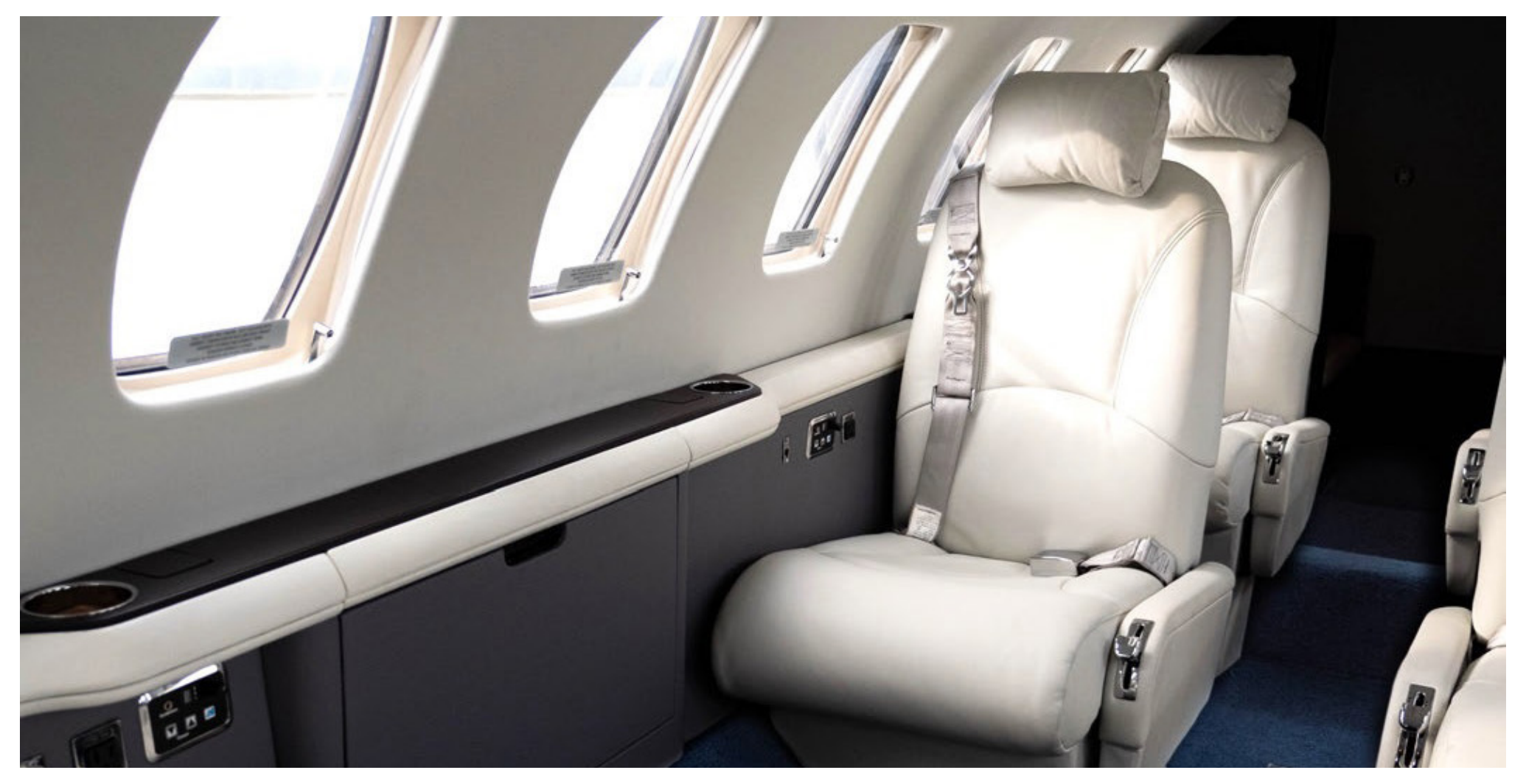
Specifications and descriptions are provided as introductory information only and do not constitute representations or warranties. Verification of specifications remains the sole responsibility of the purchaser. Photographs and images may have been altered to remove logos, registration marks, or other identifying information to protect the privacy of the current owner. Please note that images may not reflect the aircraft's most current condition as of this listing. The aircraft is subject to prior sale, lease, or removal from the market without notice.

Serial Number: 560-0584 • Registration Number: N801CB