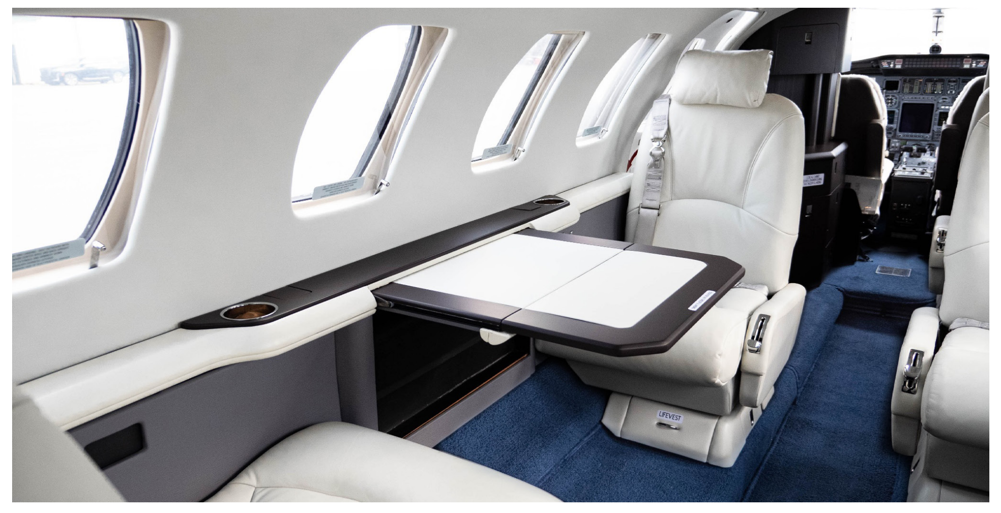
Specifications and descriptions are provided as introductory information only and do not constitute representations or warranties. Verification of specifications remains the sole responsibility of the purchaser. Photographs and images may have been altered to remove logos, registration marks, or other identifying information to protect the privacy of the current owner. Please note that images may not reflect the aircraft's most current condition as of this listing. The aircraft is subject to prior sale, lease, or removal from the market without notice.

Serial Number: 560-0584 • Registration Number: N801CB