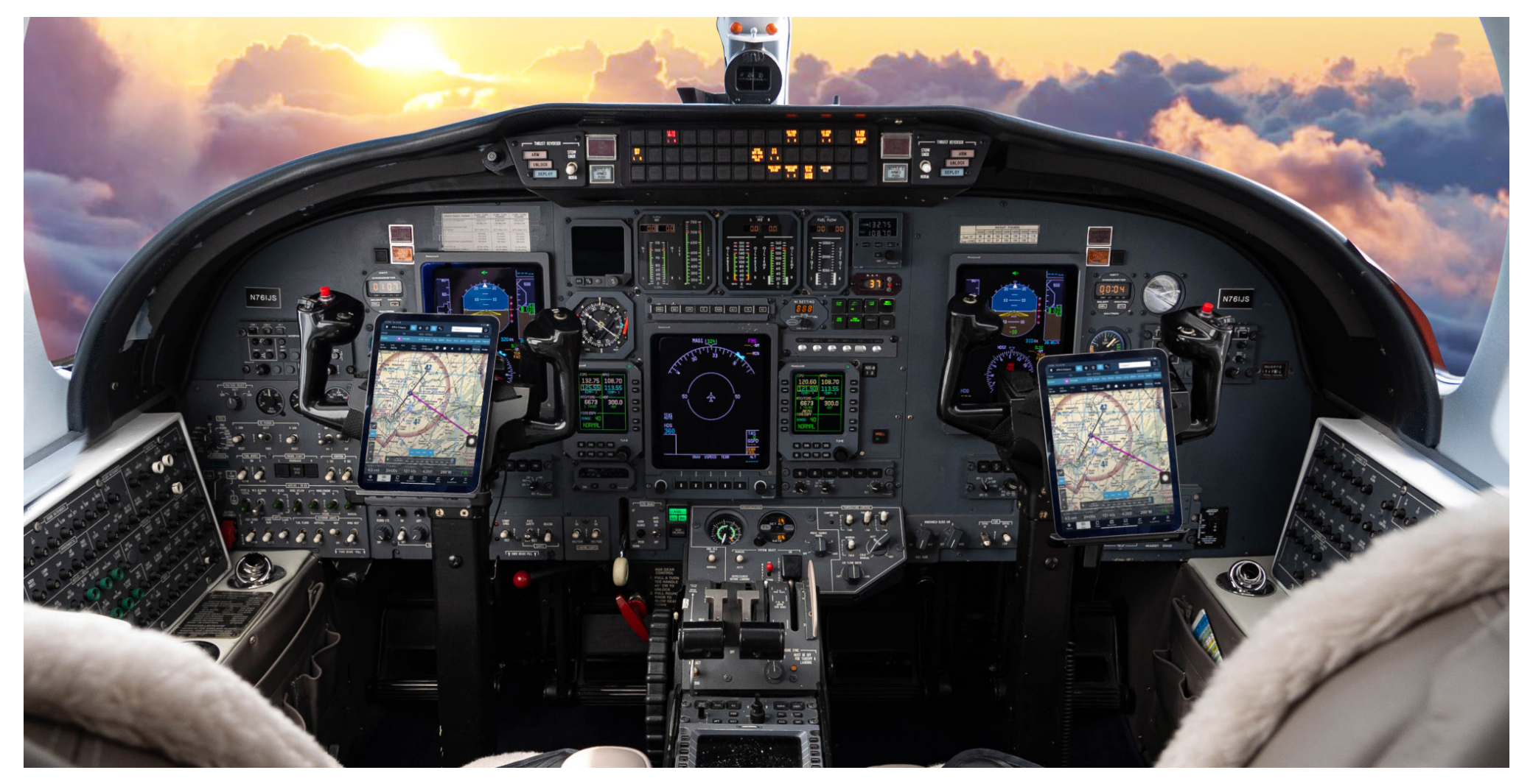
Specifications and descriptions are provided as introductory information only and do not constitute representations or warranties, Verification of specifications remains the sole responsibility of the purchaser. Photographs and images may have been altered to remove logos, registration

Serial Number: 560-0584 • Registration Number: N801CB