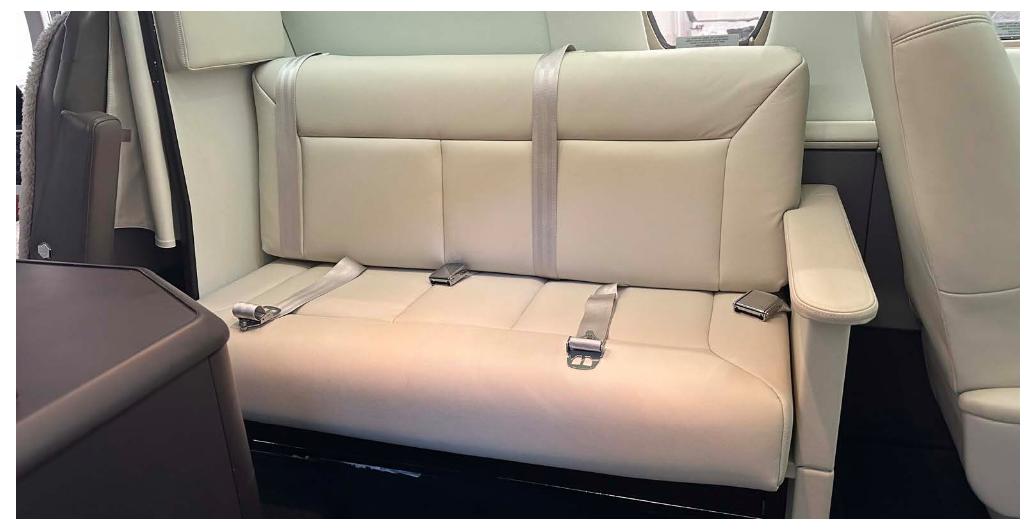
Specifications and descriptions are provided as introductory information only and do not constitute representations or warranties. Verification of specifications remains the sole responsibility of the purchaser. Photographs and images may have been altered to remove logos, registration marks, or other identifying information to protect the privacy of the current owner. Please note that images may not reflect the aircraft's most current condition as of this listing. The aircraft is subject to prior sale, lease, or removal from the market without notice.

Serial Number: 560-0584 • Registration Number: N801CB