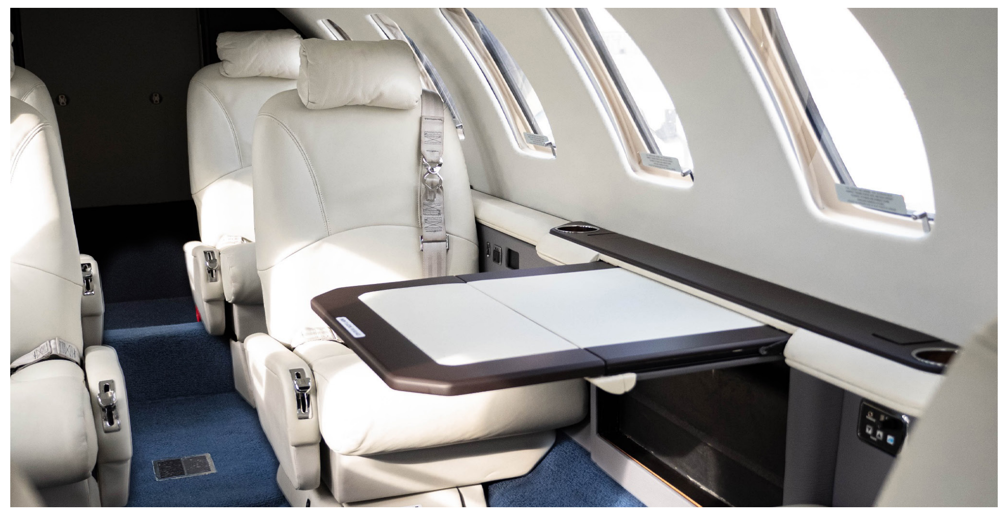
Specifications and descriptions are provided as introductory information only and do not constitute representations or warranties. Verification of specifications remains the sole responsibility of the purchaser. Photographs and images may have been altered to remove logos, registration marks, or other identifying information to protect the privacy of the current owner. Please note that images may not reflect the aircraft's most current condition as of this listing. The aircraft is subject to prior sale, lease, or removal from the market without notice.