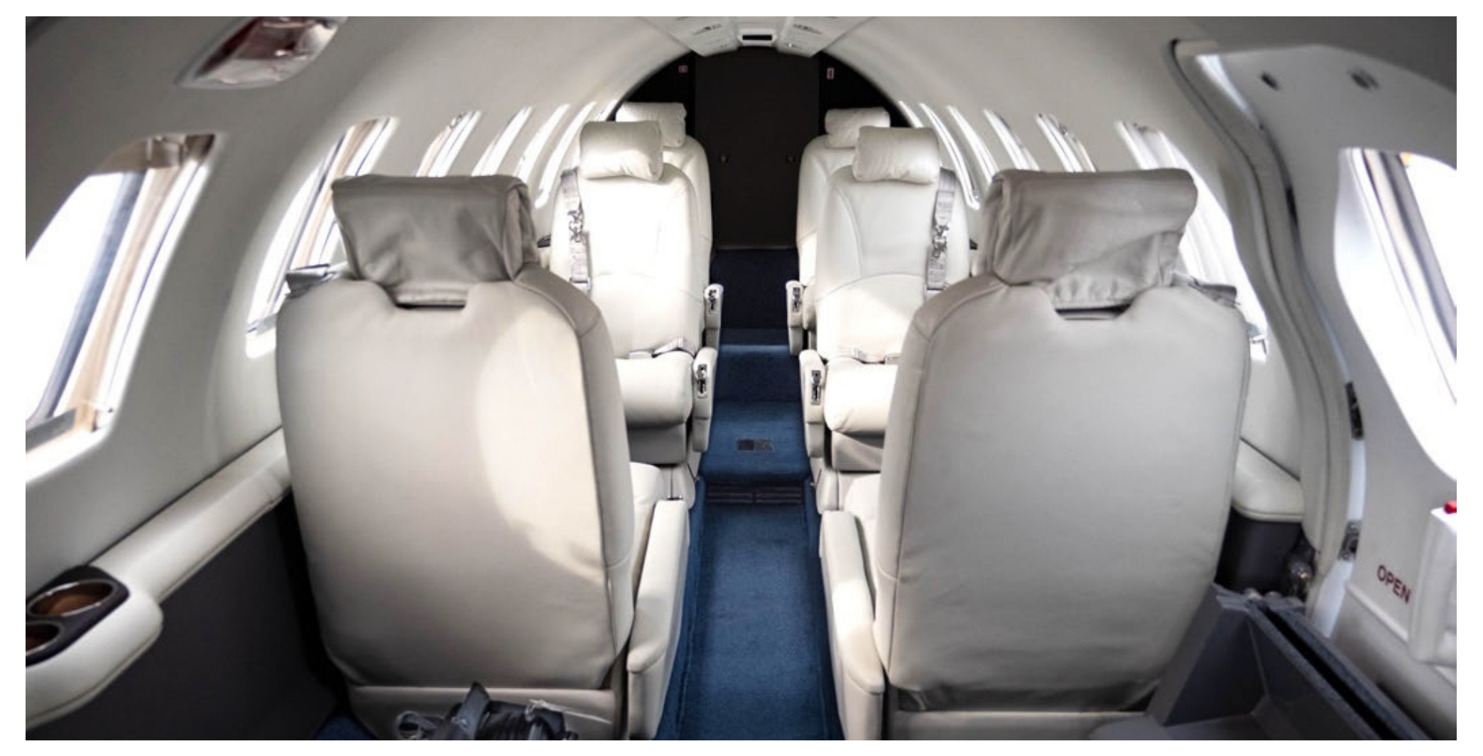
Specifications and descriptions are provided as introductory information only and do not constitute representations or warranties. Verification of specifications remains the sole responsibility of the purchaser. Photographs and images may have been altered to remove logos, registration