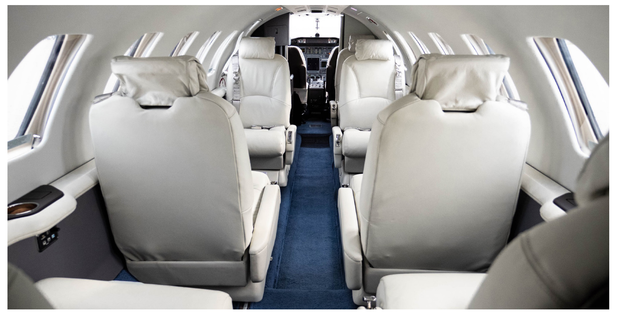
Specifications and descriptions are provided as introductory information only and do not constitute representations or warranties. Verification of specifications remains the sole responsibility of the purchaser. Photographs and images may have been altered to remove logos, registration