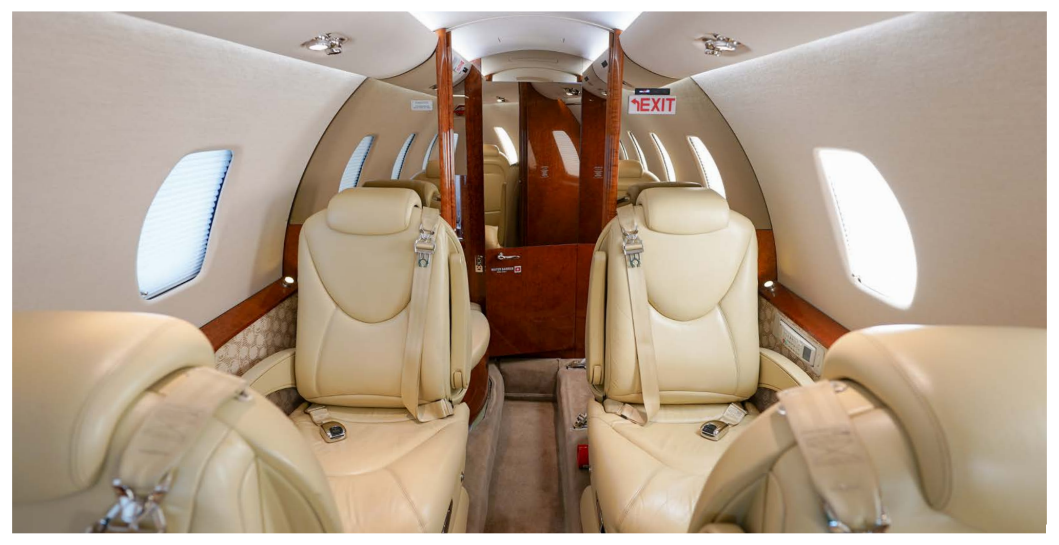
Specifications and descriptions are provided as introductory information only and do not constitute representations or warranties. Verification of specifications remains the sole responsibility of the purchaser. Photographs and images may have been altered to remove logos, registration marks, or other identifying information to protect the privacy of the current owner. Please note that images may not reflect the aircraft's most current condition as of this listing. The aircraft is subject to prior sale, lease, or removal from the market without notice.