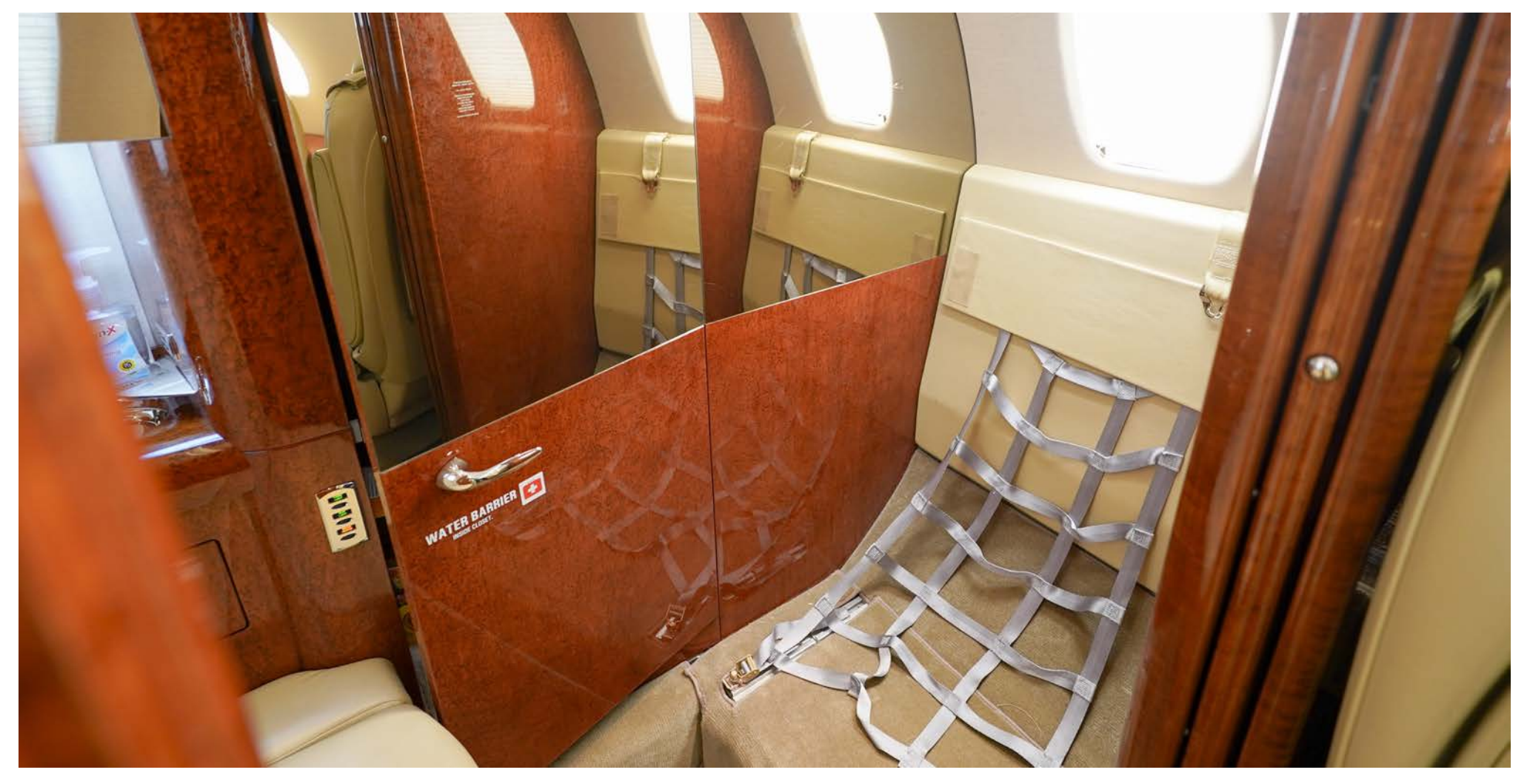
Specifications and descriptions are provided as introductory information only and do not constitute representations or warranties. Verification of specifications remains the sole responsibility of the purchaser. Photographs and images may have been altered to remove logos, registration marks, or other identifying information to protect the privacy of the current owner. Please note that images may not reflect the aircraft's most current condition as of this listing. The aircraft is subject to prior sale, lease, or removal from the market without notice.