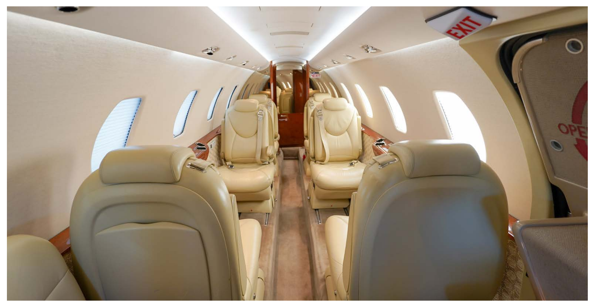
Specifications and descriptions are provided as introductory information only and do not constitute representations or warranties. Verification of specifications remains the sole responsibility of the purchaser. Photographs and images may have been altered to remove logos, registration marks, or other identifying information to protect the privacy of the current owner. Please note that images may not reflect the aircraft's most current condition as of this listing. The aircraft is subject to prior sale, lease, or removal from the market without notice.