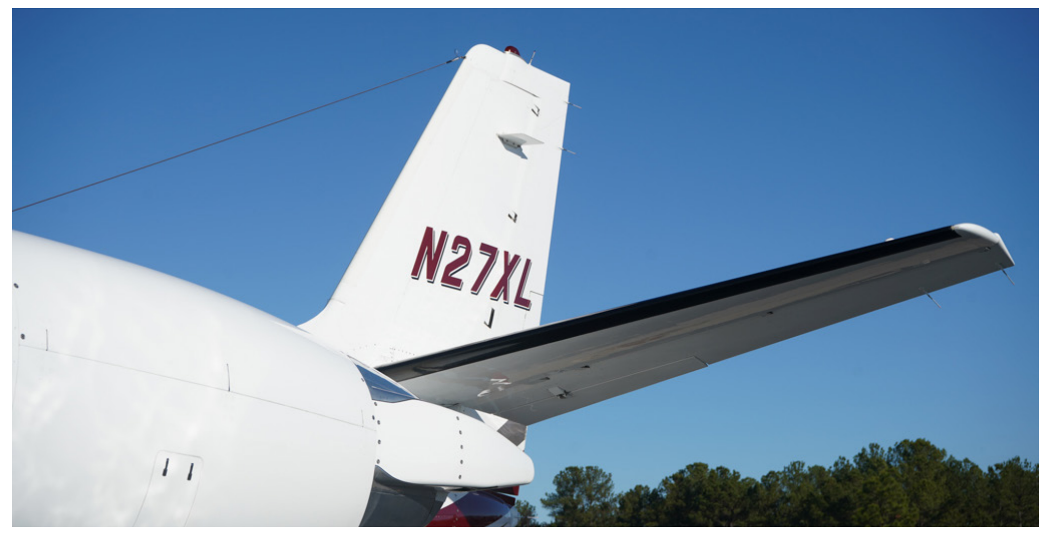
Specifications and descriptions are provided as introductory information only and do not constitute representations or warranties. Verification of specifications remains the sole responsibility of the purchaser. Photographs and images may have been altered to remove logos, registration marks, or other identifying information to protect the privacy of the current owner. Please note that images may not reflect the aircraft's most current condition as of this listing. The aircraft is subject to prior sale, lease, or removal from the market without notice.