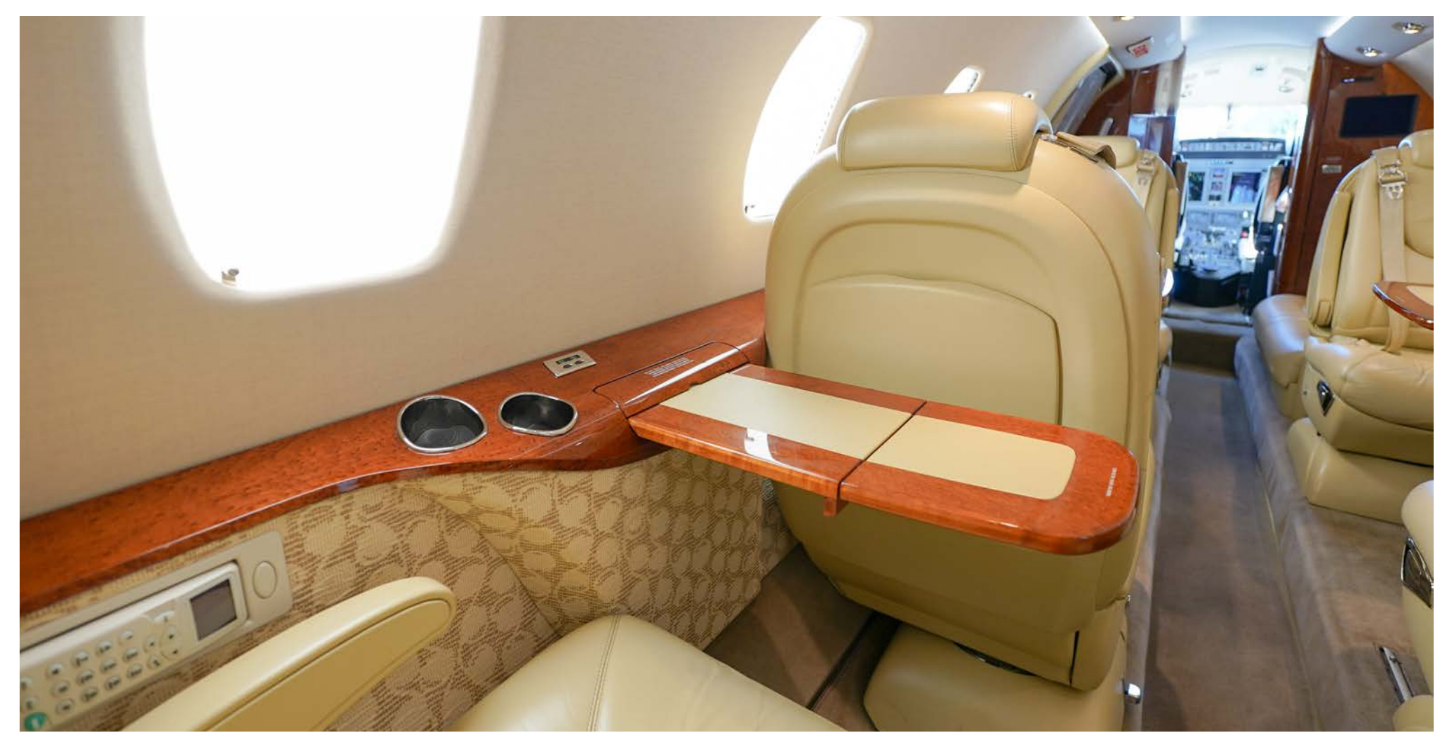
Specifications and descriptions are provided as introductory information only and do not constitute representations or warranties. Verification of specifications remains the sole responsibility of the purchaser. Photographs and images may have been altered to remove logos, registration marks, or other identifying information to protect the privacy of the current owner. Please note that images may not reflect the aircraft's most current condition as of this listing. The aircraft is subject to prior sale, lease, or removal from the market without notice.