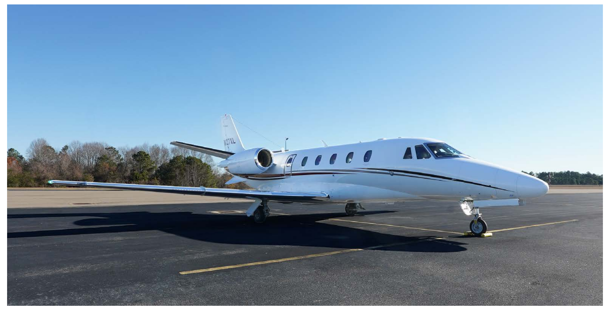
Specifications and descriptions are provided as introductory information only and do not constitute representations or warranties. Verification of specifications remains the sole responsibility of the purchaser. Photographs and images may have been altered to remove logos, registration marks, or other identifying information to protect the privacy of the current owner. Please note that images may not reflect the aircraft's most current condition as of this listing. The aircraft is subject to prior sale, lease, or removal from the market without notice.