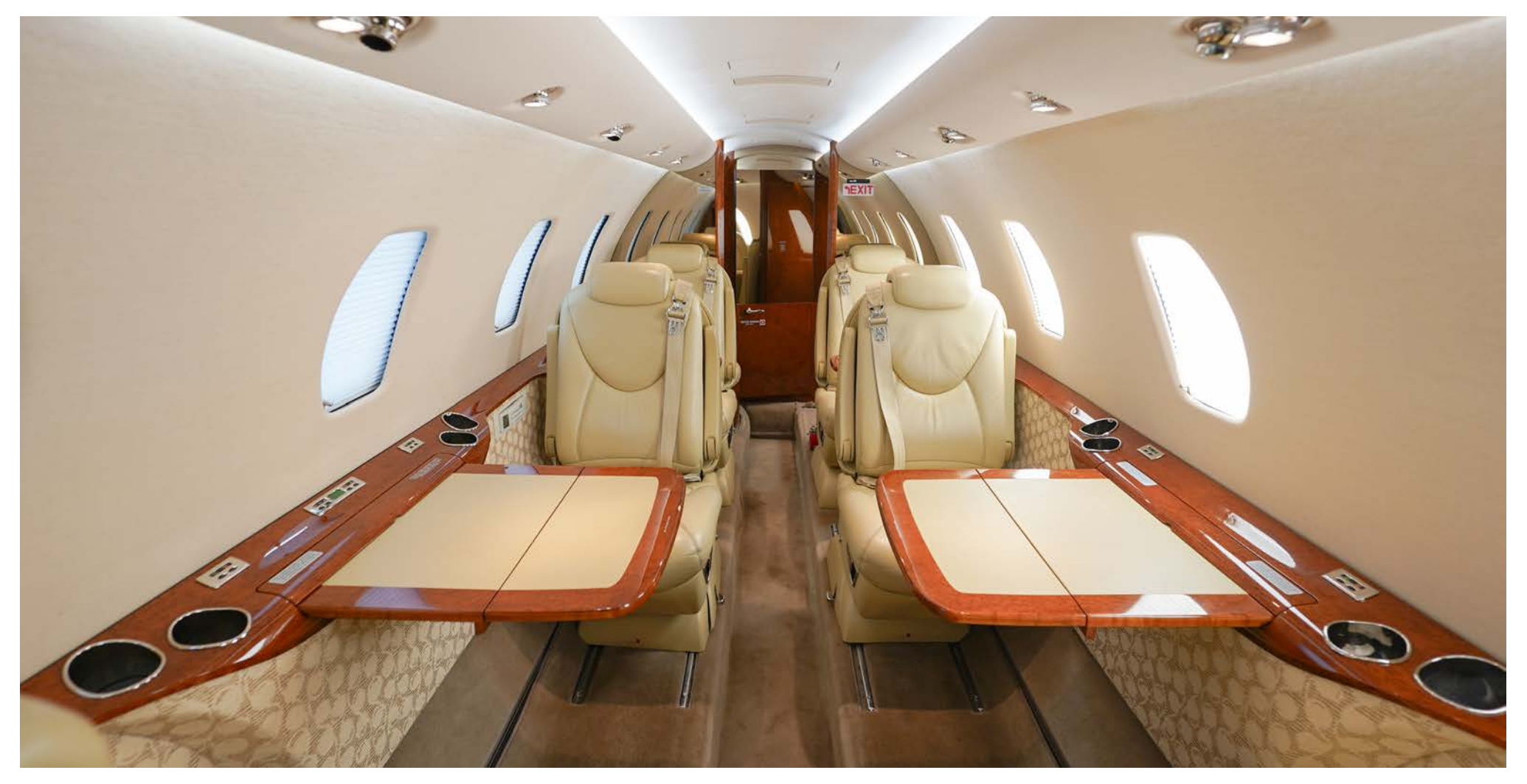
Specifications and descriptions are provided as introductory information only and do not constitute representations or warranties. Verification of specifications remains the sole responsibility of the purchaser. Photographs and images may have been altered to remove logos, registration marks, or other identifying information to protect the privacy of the current owner. Please note that images may not reflect the aircraft's most current condition as of this listing. The aircraft is subject to prior sale, lease, or removal from the market without notice.