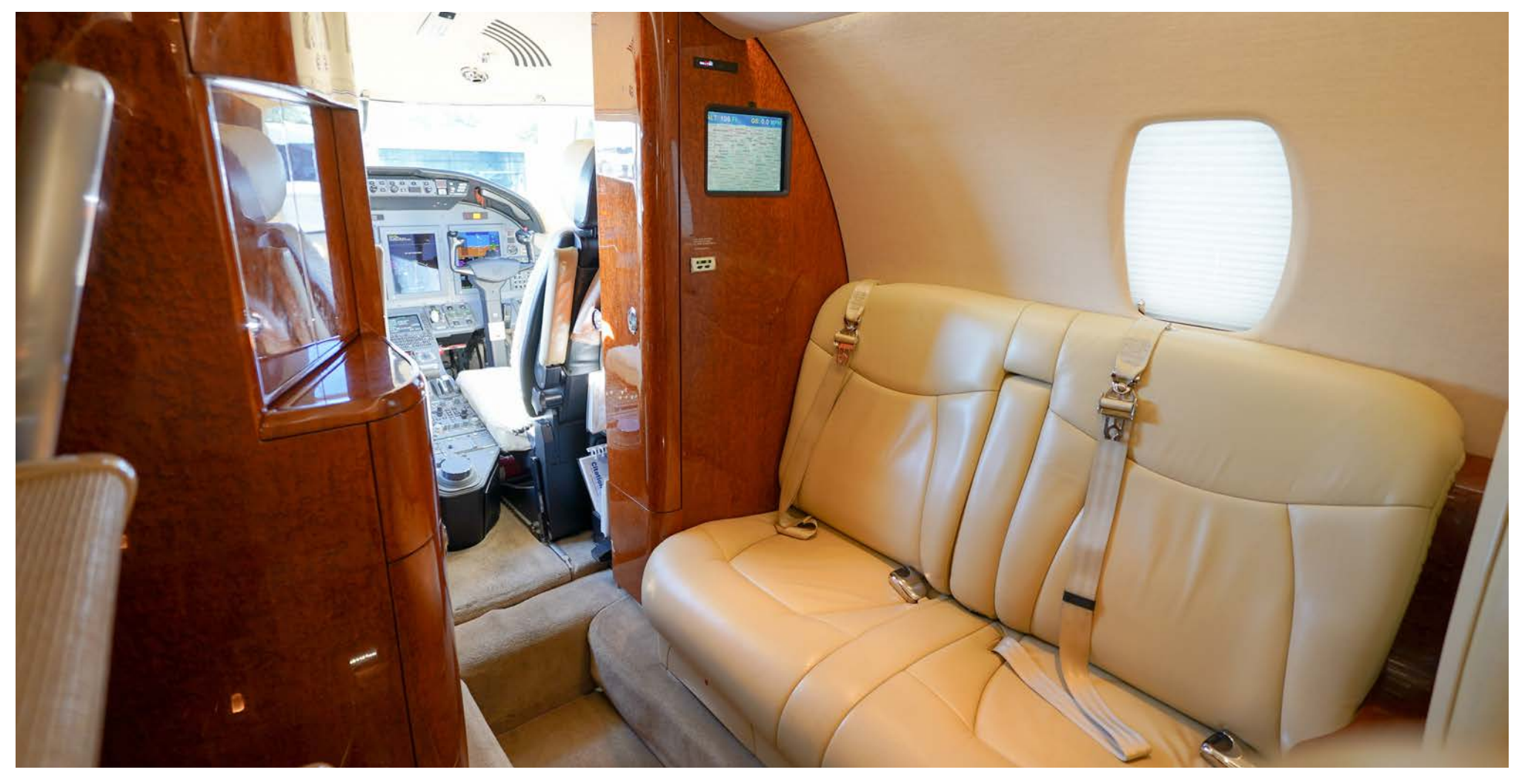
Specifications and descriptions are provided as introductory information only and do not constitute representations or warranties. Verification of specifications remains the sole responsibility of the purchaser. Photographs and images may have been altered to remove logos, registration marks, or other identifying information to protect the privacy of the current owner. Please note that images may not reflect the aircraft's most current condition as of this listing. The aircraft is subject to prior sale, lease, or removal from the market without notice.