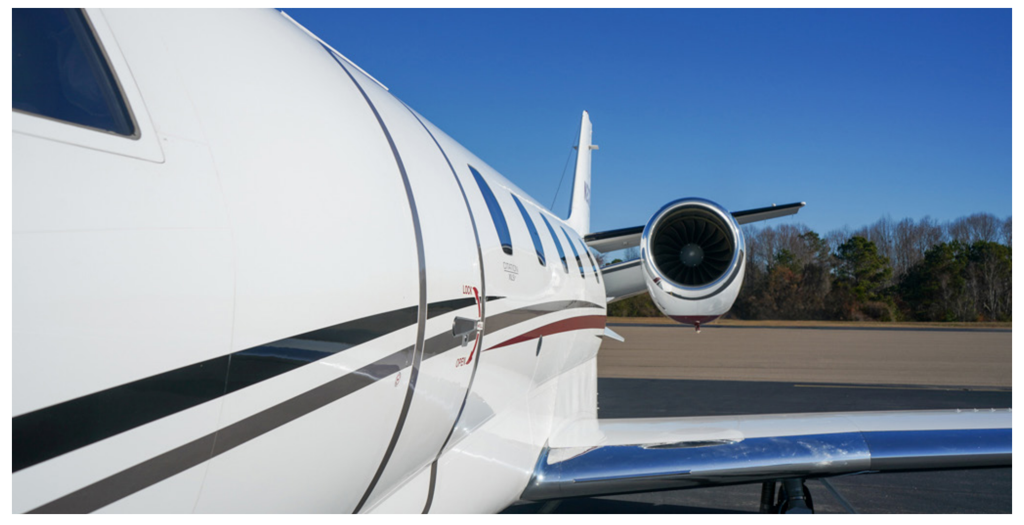
Specifications and descriptions are provided as introductory information only and do not constitute representations or warranties. Verification of specifications remains the sole responsibility of the purchaser. Photographs and images may have been altered to remove logos, registration marks, or other identifying information to protect the privacy of the current owner. Please note that images may not reflect the aircraft's most current condition as of this listing. The aircraft is subject to prior sale, lease, or removal from the market without notice.