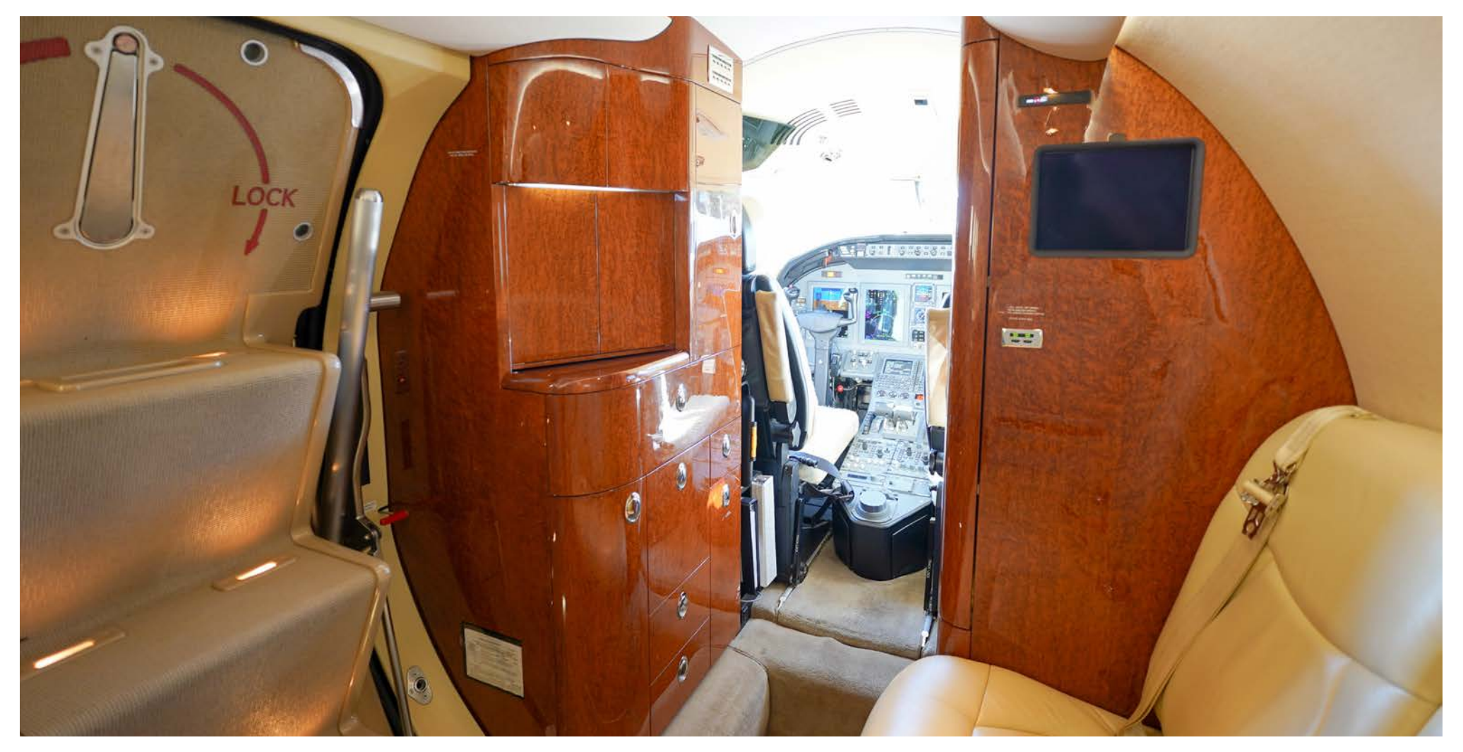
Specifications and descriptions are provided as introductory information only and do not constitute representations or warranties. Verification of specifications remains the sole responsibility of the purchaser. Photographs and images may have been altered to remove logos, registration marks, or other identifying information to protect the privacy of the current owner. Please note that images may not reflect the aircraft's most current condition as of this listing. The aircraft is subject to prior sale, lease, or removal from the market without notice.