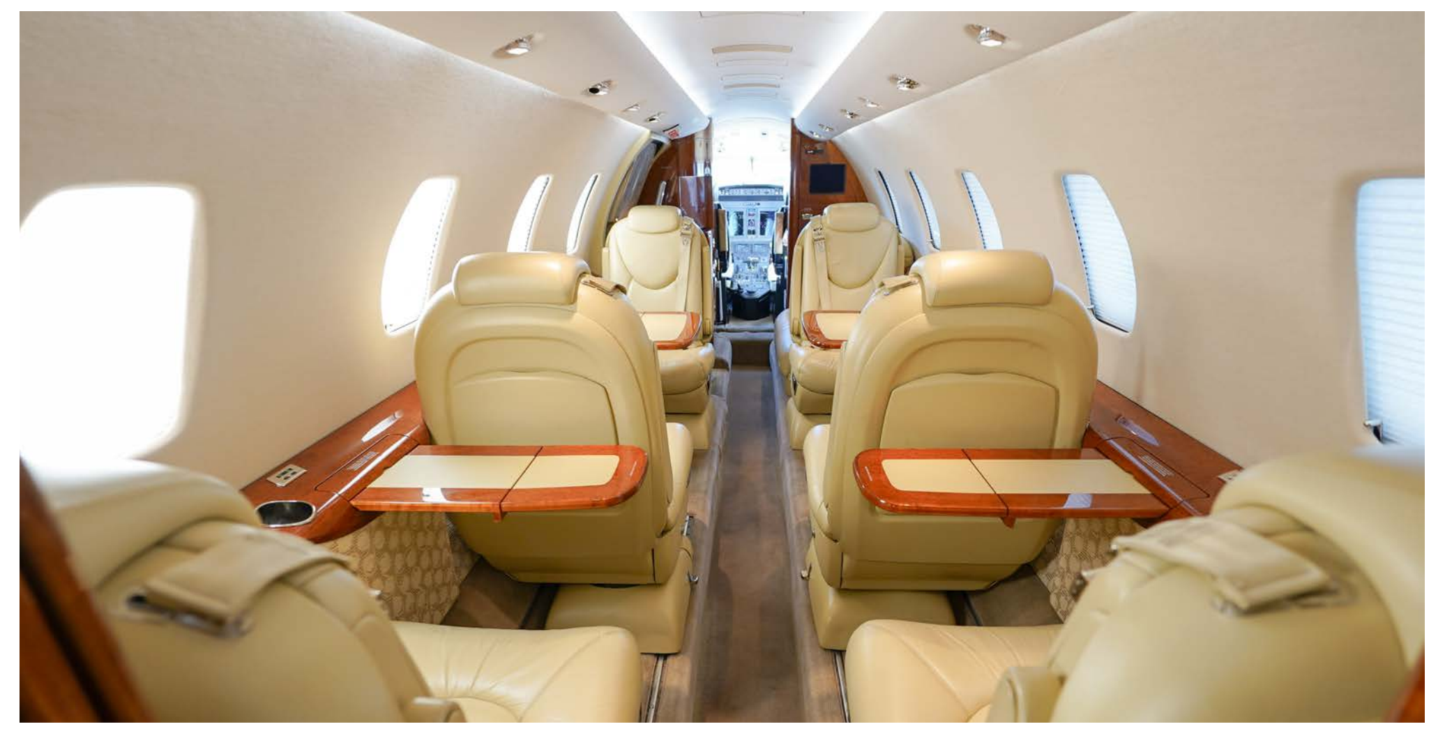
Specifications and descriptions are provided as introductory information only and do not constitute representations or warranties. Verification of specifications remains the sole responsibility of the purchaser. Photographs and images may have been altered to remove logos, registration marks, or other identifying information to protect the privacy of the current owner. Please note that images may not reflect the aircraft's most current condition as of this listing. The aircraft is subject to prior sale, lease, or removal from the market without notice.