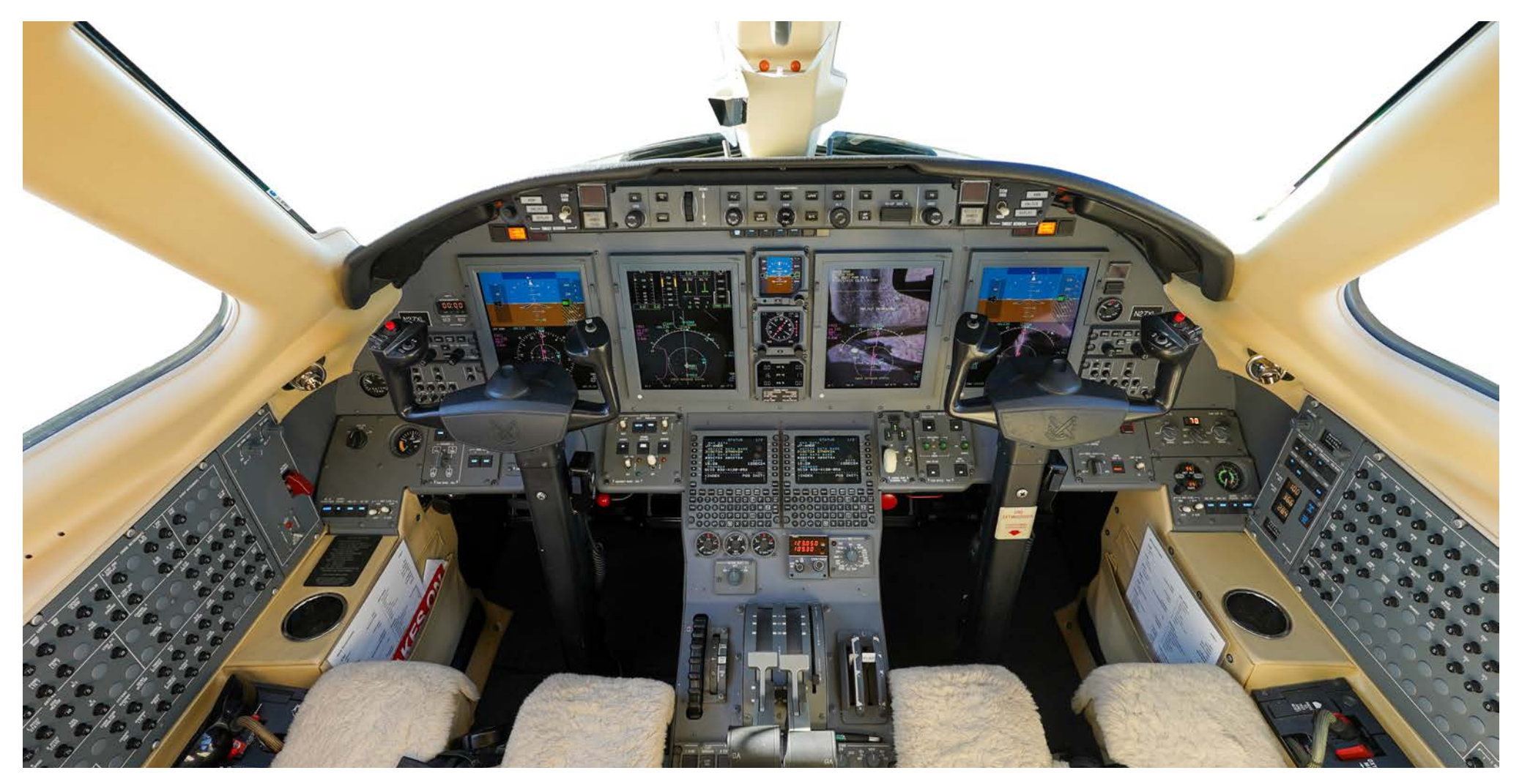
Specifications and descriptions are provided as introductory information only and do not constitute representations or warranties. Verification of specifications remains the sole responsibility of the purchaser. Photographs and images may have been altered to remove logos, registration