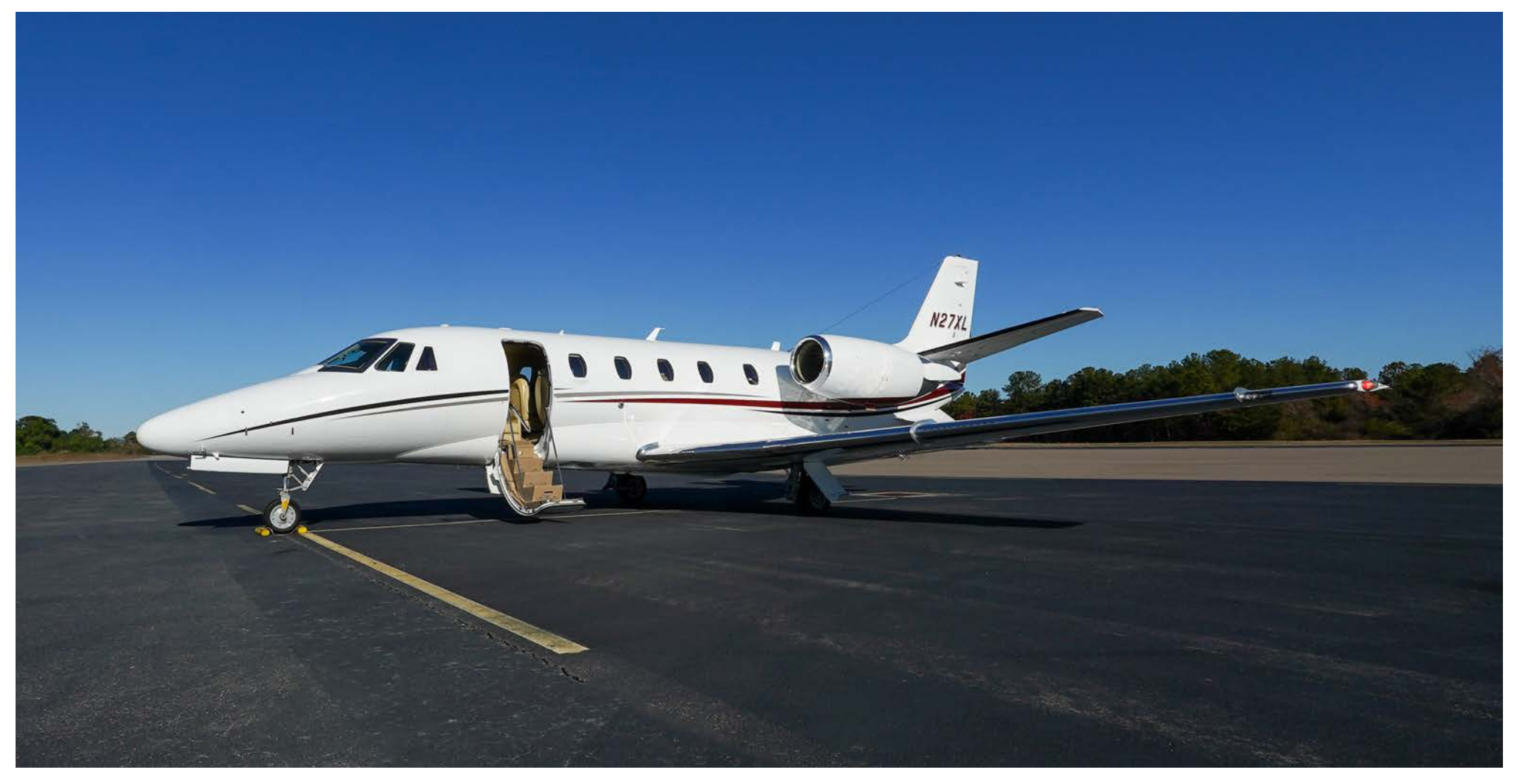
Specifications and descriptions are provided as introductory information only and do not constitute representations or warranties. Verification of specifications remains the sole responsibility of the purchaser. Photographs and images may have been altered to remove logos, registration marks, or other identifying information to protect the privacy of the current owner. Please note that images may not reflect the aircraft's most current condition as of this listing. The aircraft is subject to prior sale, lease, or removal from the market without notice.