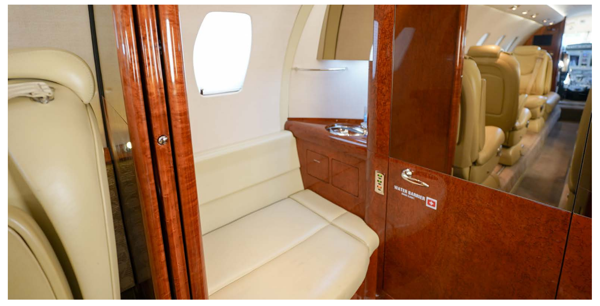
Specifications and descriptions are provided as introductory information only and do not constitute representations or warranties. Verification of specifications remains the sole responsibility of the purchaser. Photographs and images may have been altered to remove logos, registration marks, or other identifying information to protect the privacy of the current owner. Please note that images may not reflect the aircraft's most current condition as of this listing. The aircraft is subject to prior sale, lease, or removal from the market without notice.

Serial Number: 560-6096 • Registration Number: N27XL