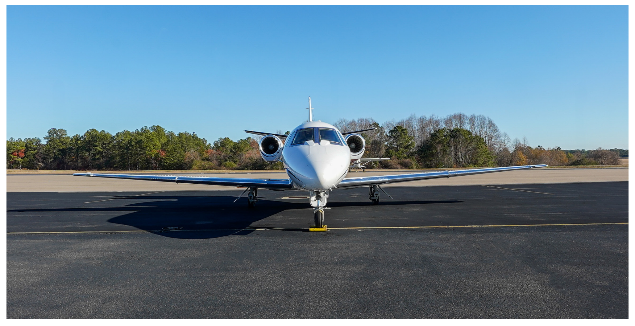
Specifications and descriptions are provided as introductory information only and do not constitute representations or warranties. Verification of specifications remains the sole responsibility of the purchaser. Photographs and images may have been altered to remove logos, registration marks, or other identifying information to protect the privacy of the current owner. Please note that images may not reflect the aircraft's most current condition as of this listing. The aircraft is subject to prior sale, lease, or removal from the market without notice.