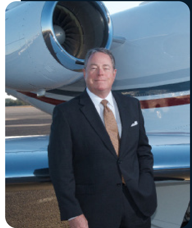
DENNIS DABBS AIRCRAFT SALES & ACQUISITIONS

Today, fewer than 7 percent of the 730 aircraft dealers worldwide have earned this prestigious accreditation from IADA, which continues its constant presence around the world and international expertise in pre-owned aircraft sales.