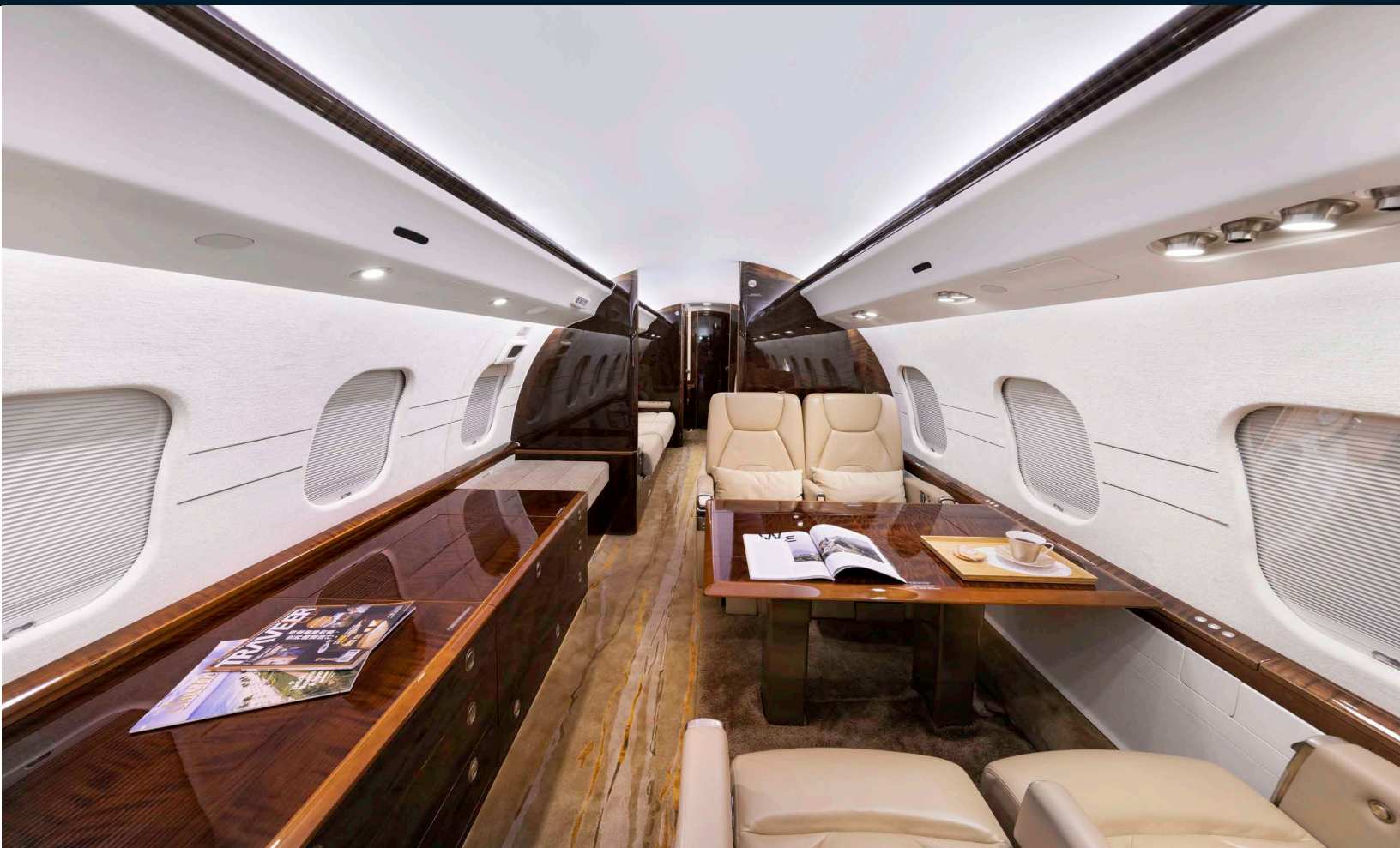
Mid cabin looking aft