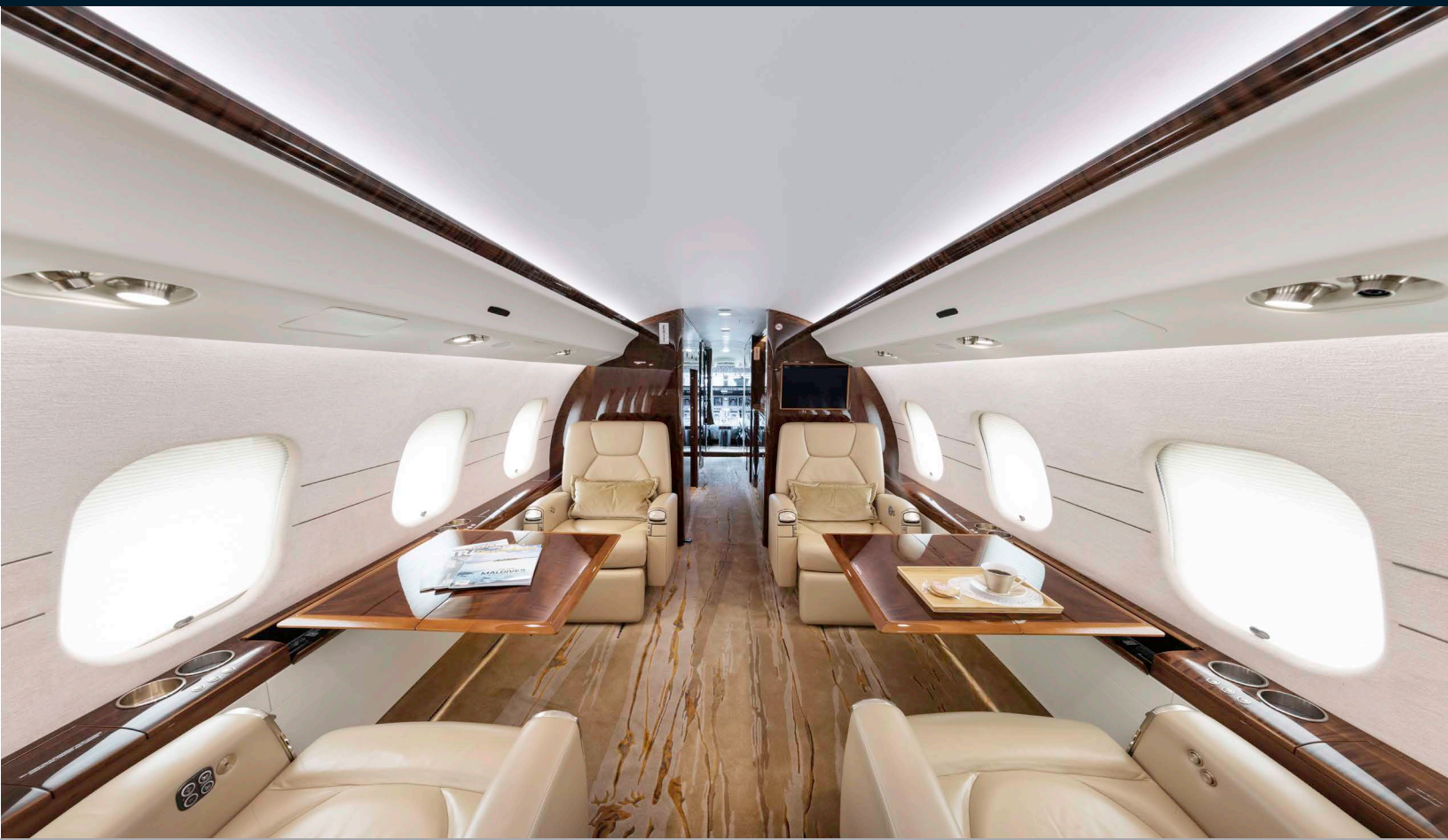
Forward cabin looking forward