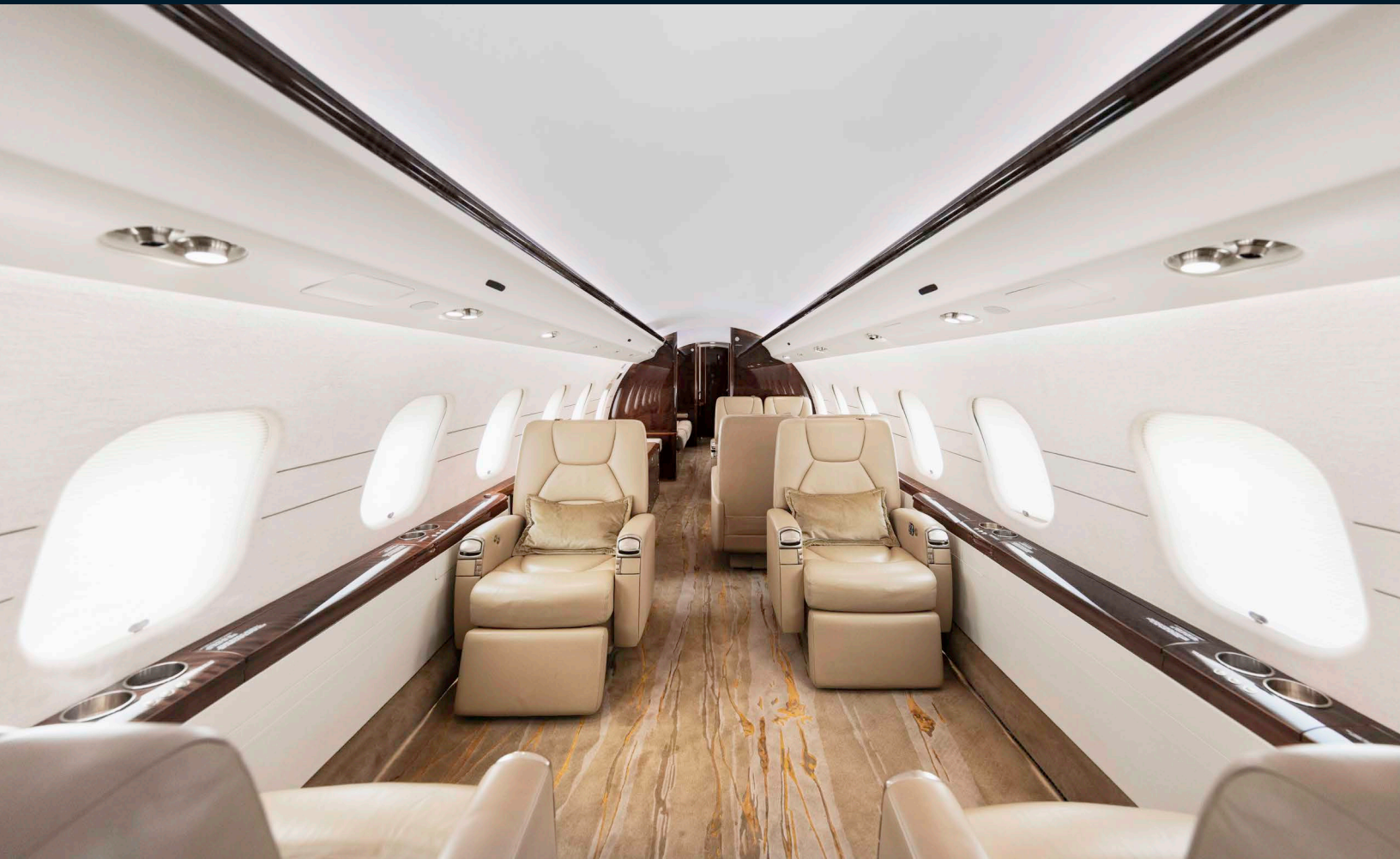
Forward cabin looking aft