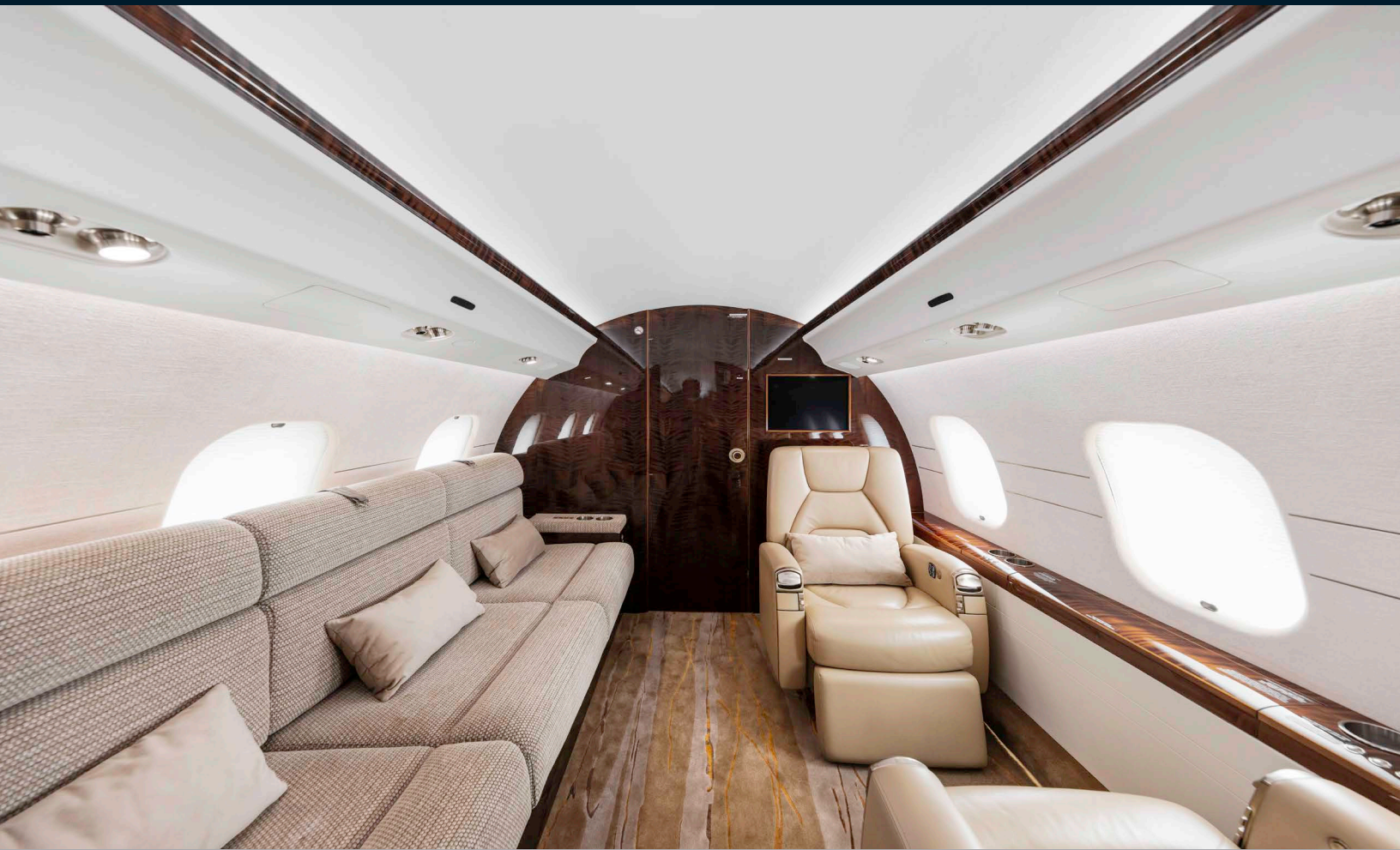
Aft cabin looking aft