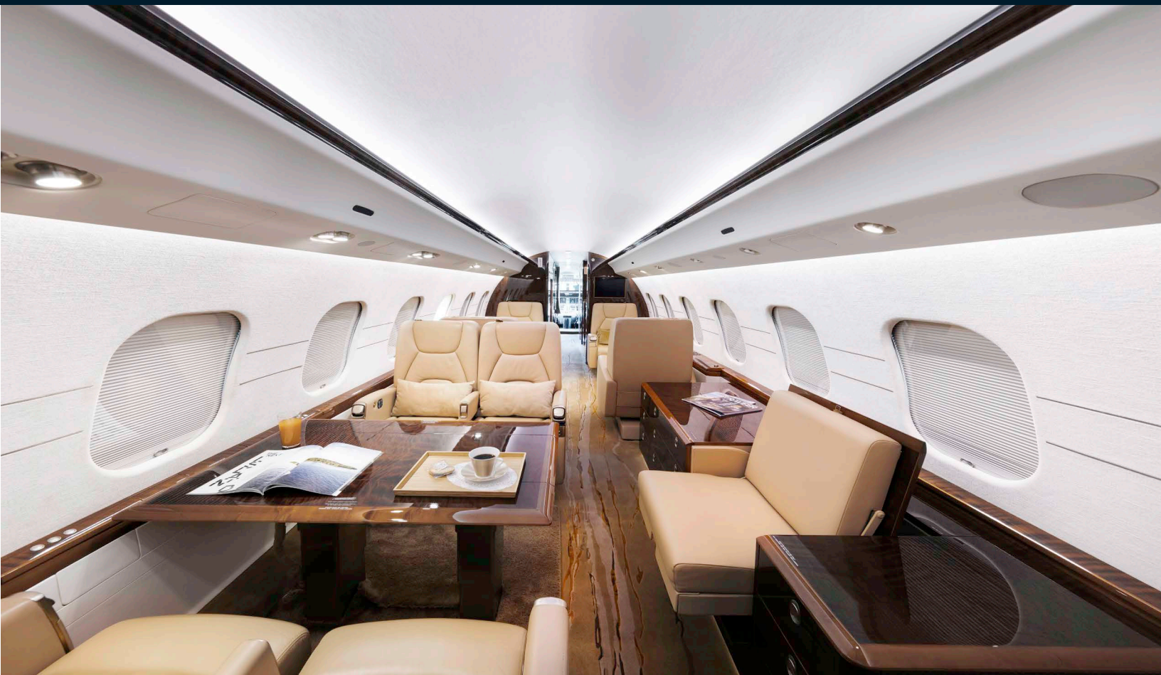
Mid cabin looking forward