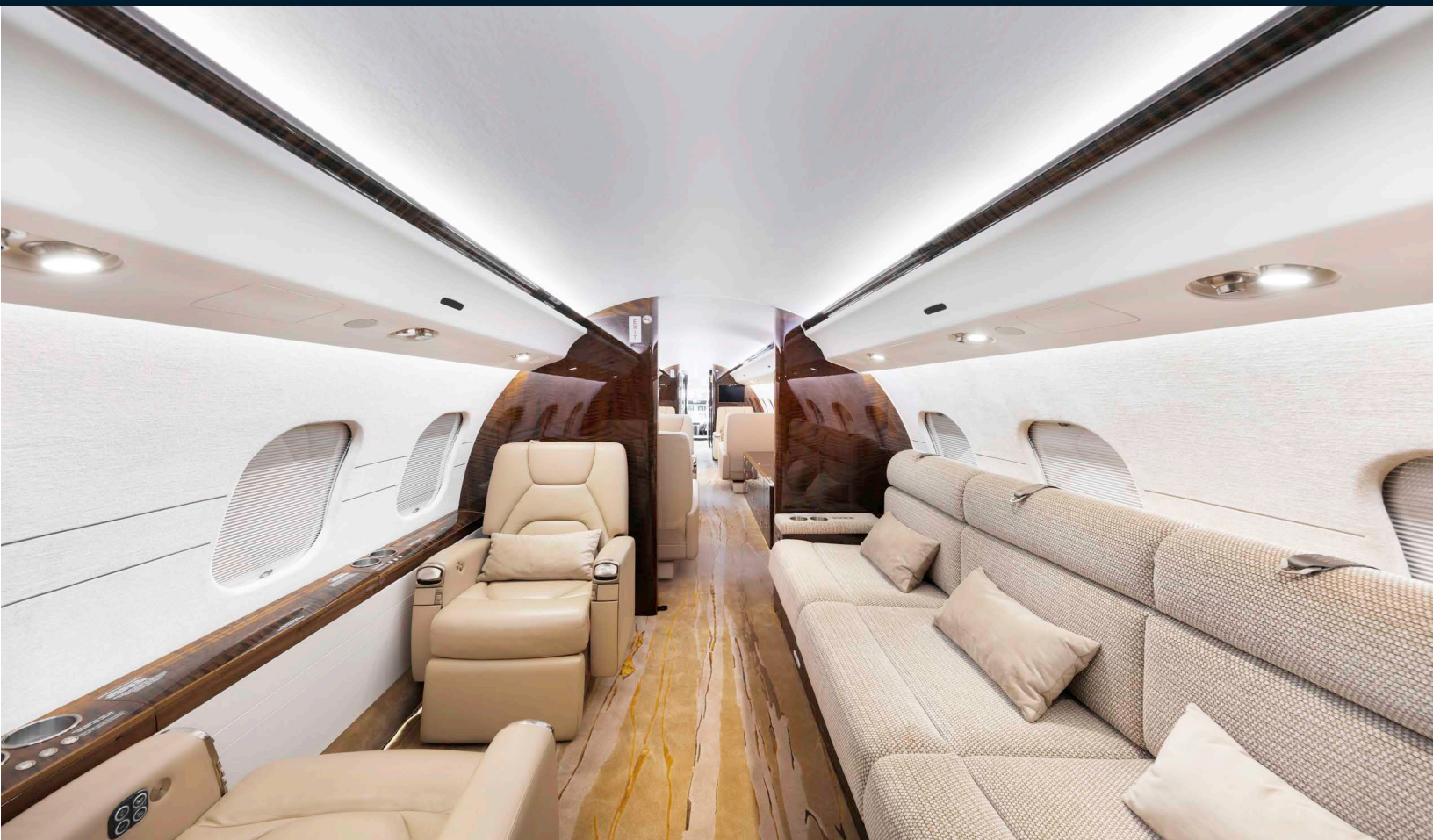
Aft cabin looking forward