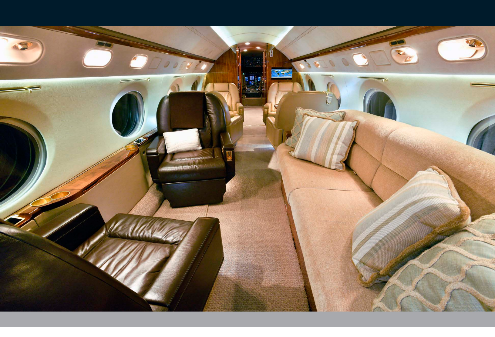
Mid cabin looking forward