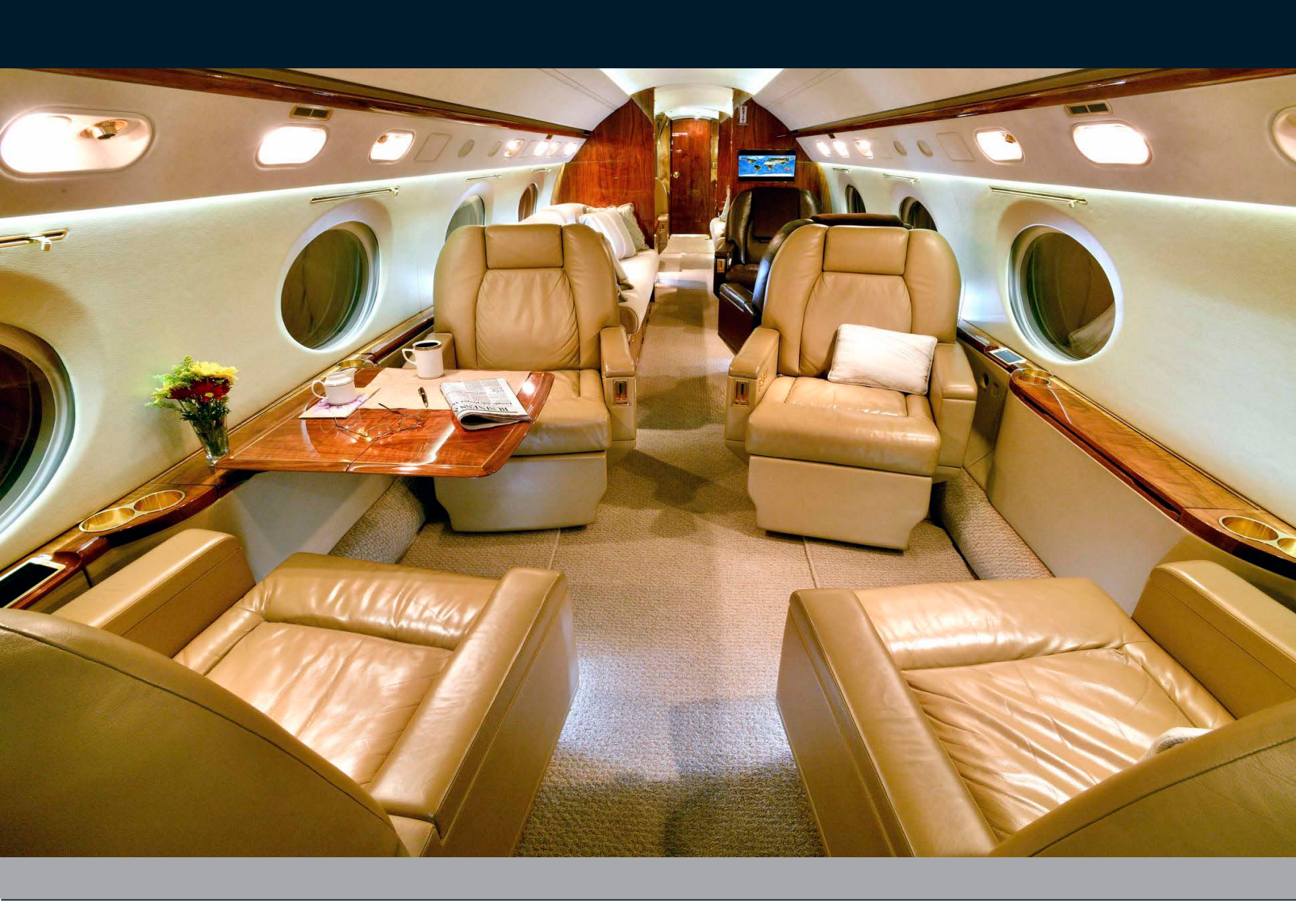
Forward cabin looking aft