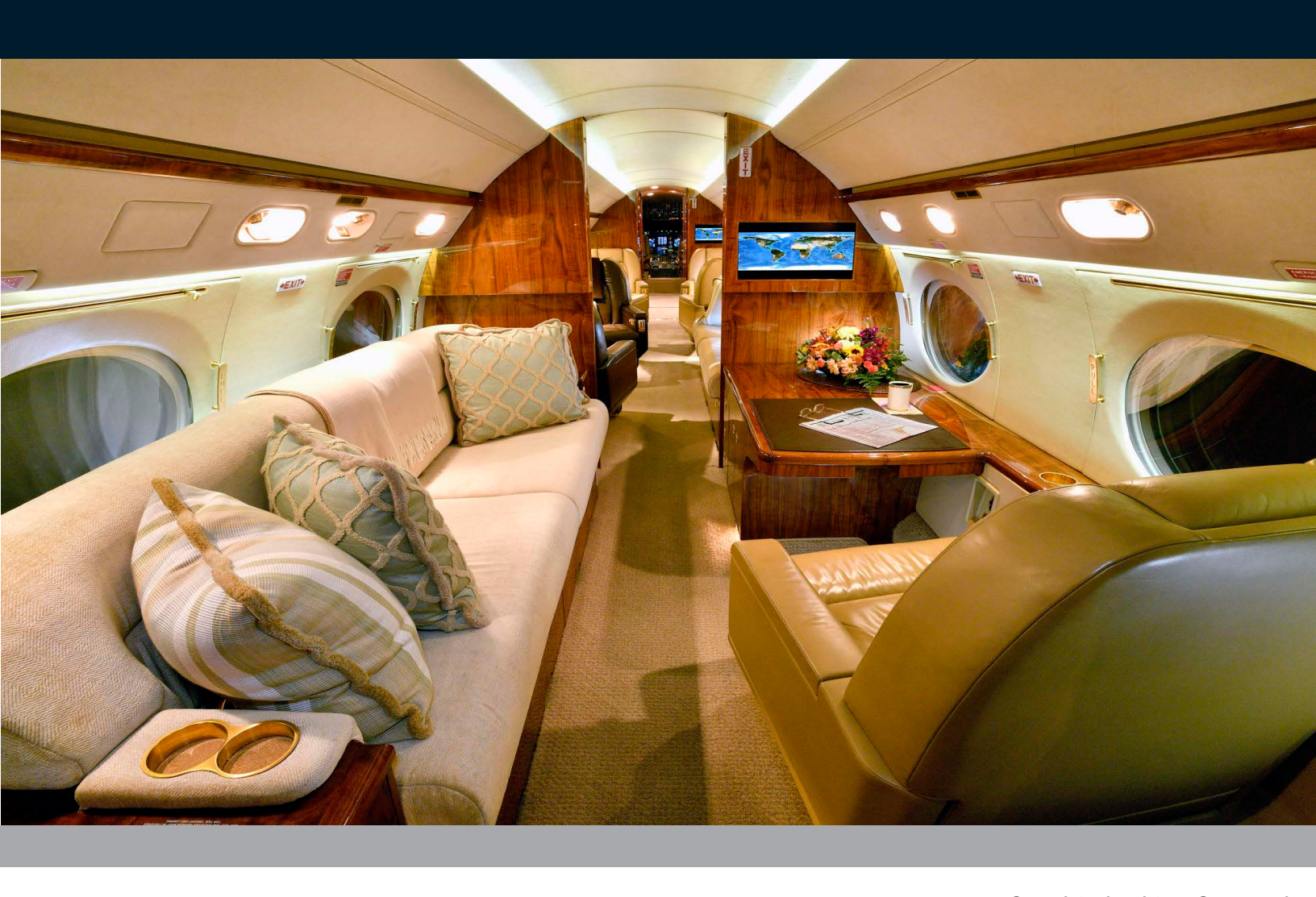
Aft cabin looking forward