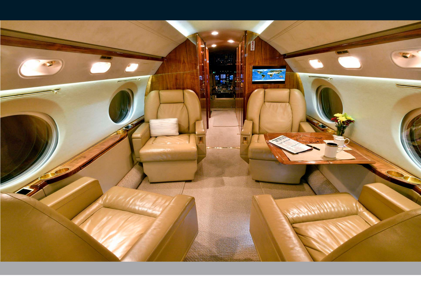
Forward cabin looking forward