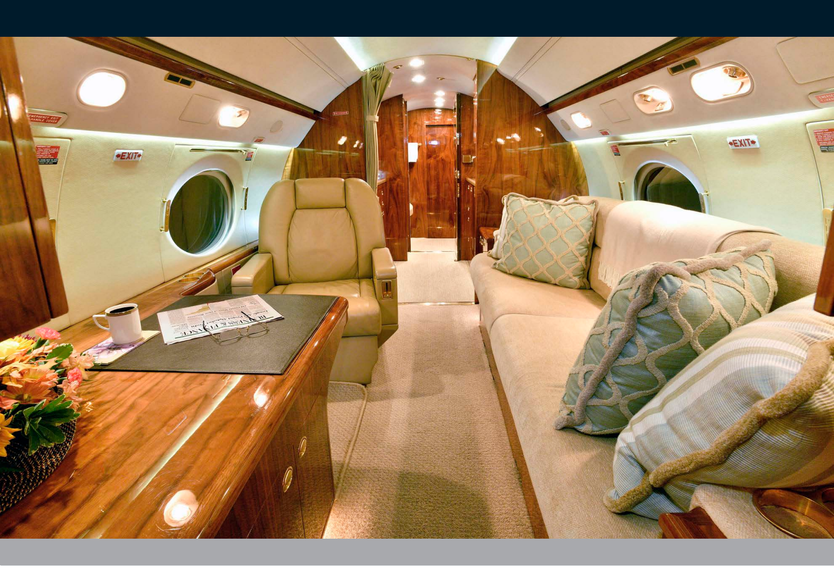
Aft cabin looking aft