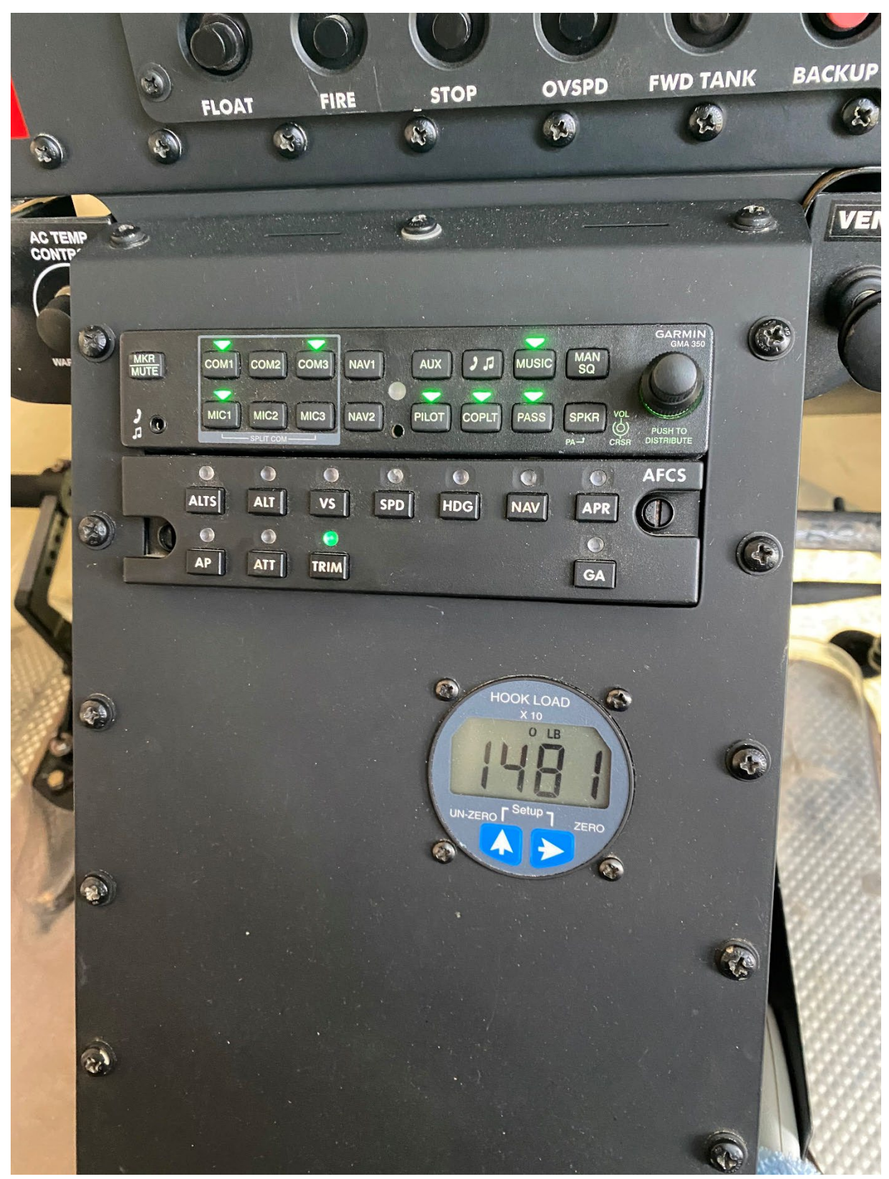
Specifications and descriptions are provided as introductory information. They do not constitute representations or warranties of International Aircraft Marketing & Sales, LLC. Accordingly, you should rely on your own inspection of the aircraft prior to making any purchase or offer to purchase.