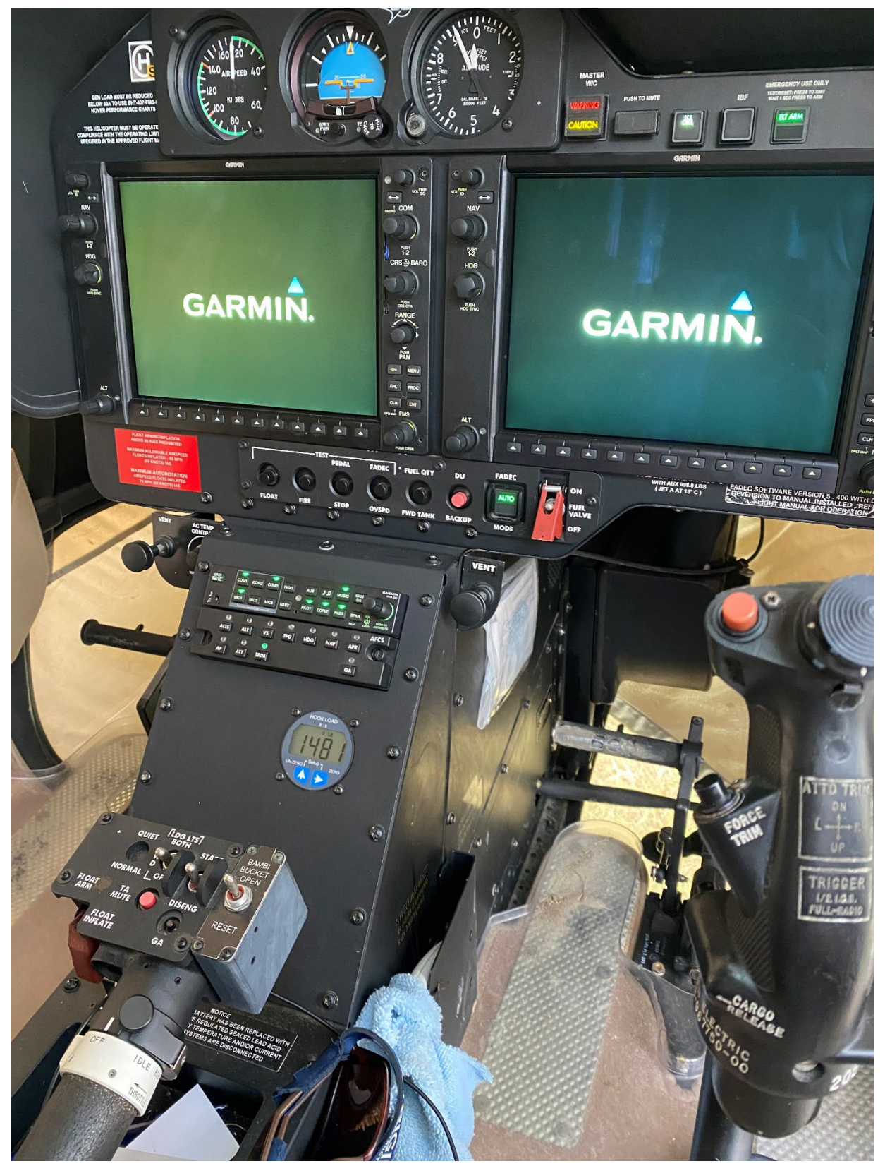
Specifications and descriptions are provided as introductory information. They do not constitute representations or warranties of International Aircraft Marketing & Sales, LLC. Accordingly, you should rely on your own inspection of the aircraft prior to making any purchase or offer to purchase.