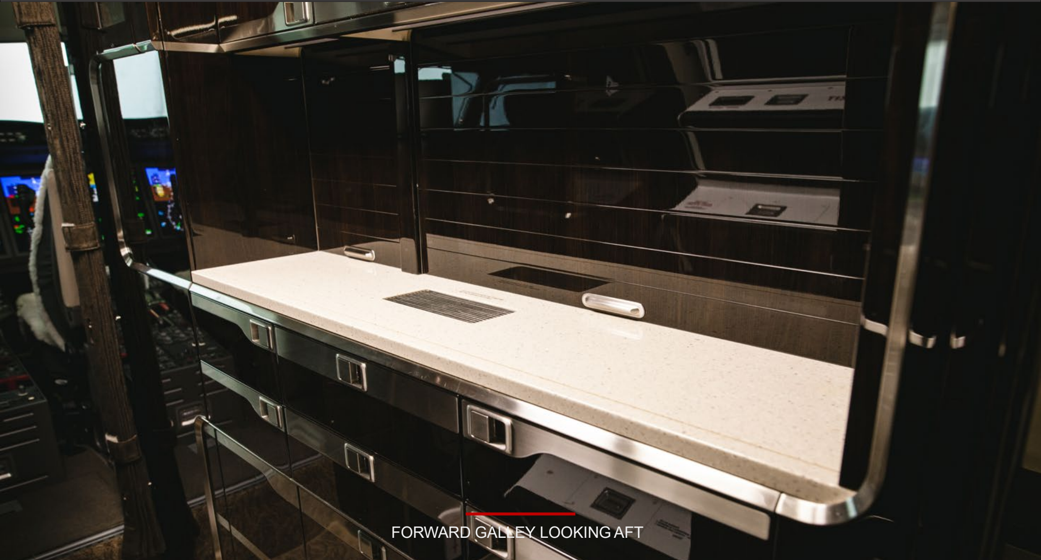
FORWARD GALLEY LOOKING AFT

info@jetedgepartners.com | +1 410 928 4022 | www.jetedgepartners.com