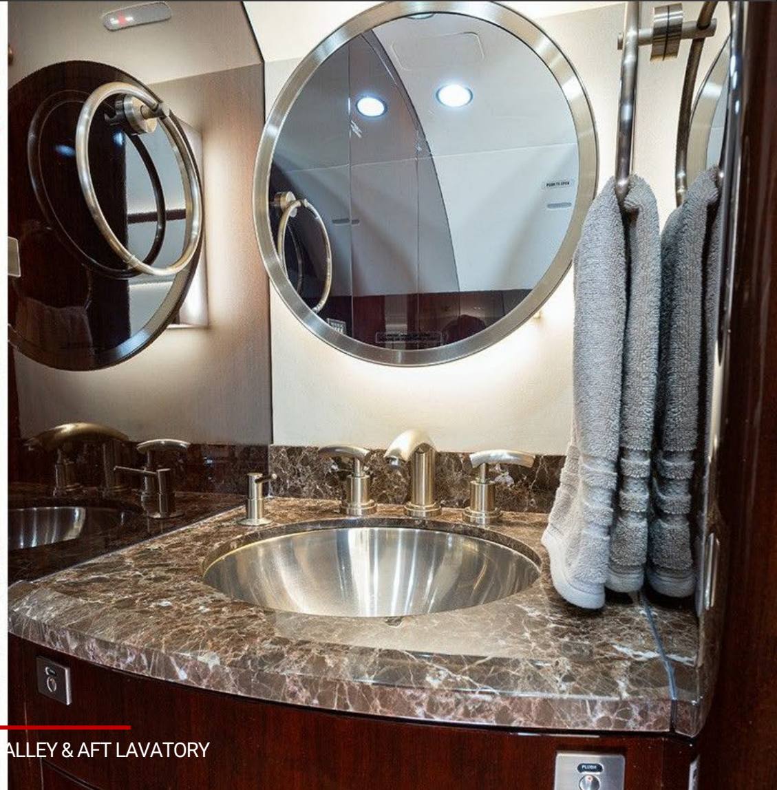
FORWARD GALLEY & AFT LAVATORY

info@jetedgepartners.com | +1 410 928 4022 | www.jetedgepartners.com